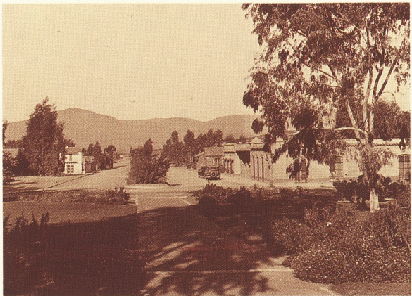
View from The Inn looking east down Paseo Delicias circa 1920