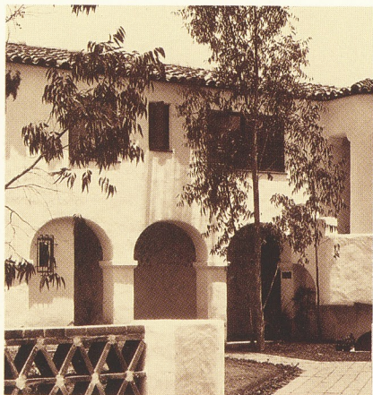
Detail of Architectural Style circa 1927