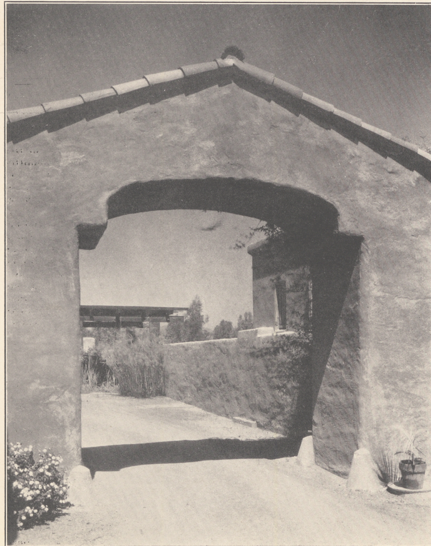
Gate of Administration garage at Rancho Santa Fe