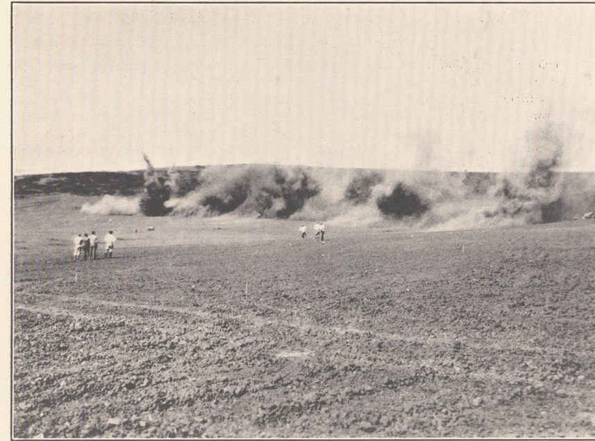
Blasting tree holes on the Hunnewell estate. Moving pictures were taken