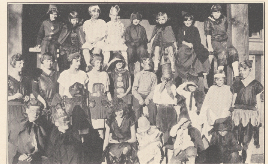
Yes, the children of Rancho Santa Fe school had a Hallowe'en party

The children were dressed in costumes appropriate to the day. Black cats, witches, elves and fairies were present, and the school room was very attractively decorated in Hallowe'en colors. Both costumes and decorations were made by the children themselves.