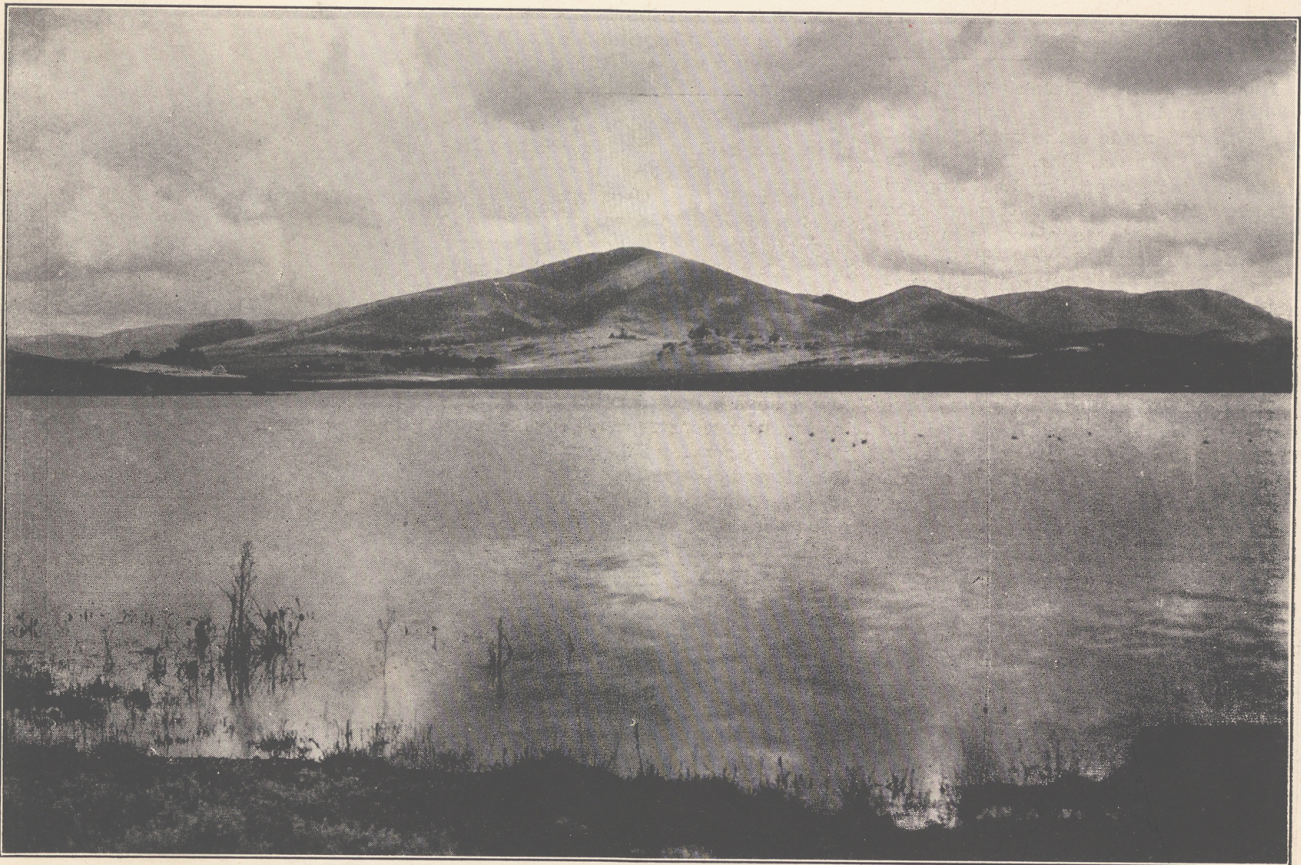
San Dieguito Lake, one of the outstanding beauty spots at Rancho Santa Fe

"It is my opinion that these trees are in excellent condition and that the pruning conforms to the recommendations of the Citrus Experiment Station and the Extension Service almost exactly. On some of these trees it was necessary to do more pruning than on others, and it seemed to me that good care had been used in determining this."