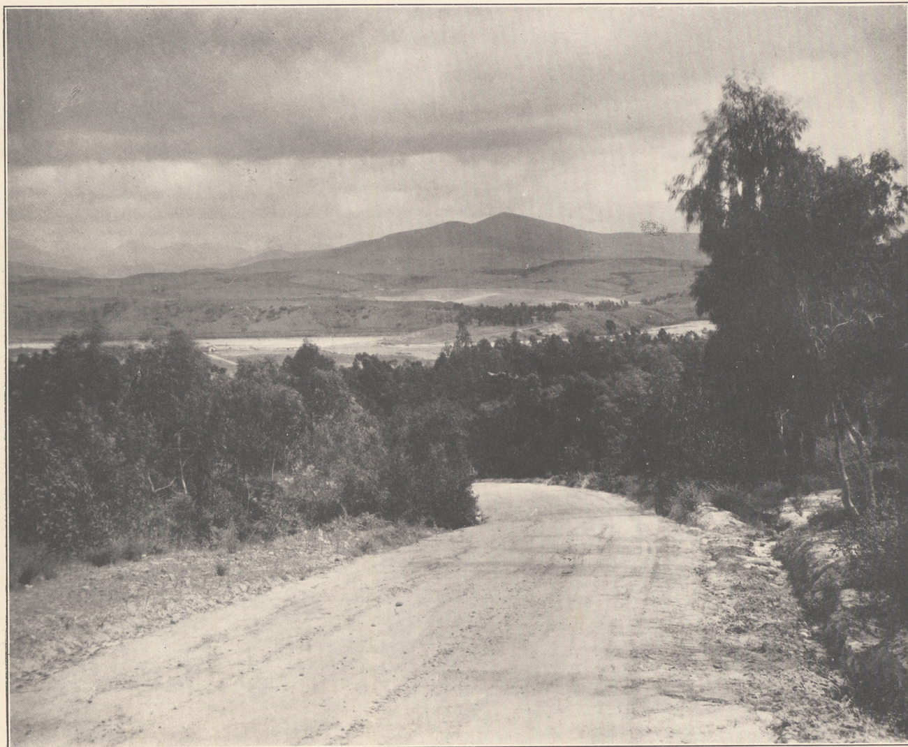
Looking across the San Dieguito River to the Fairbanks estate