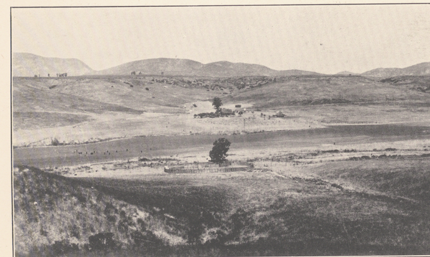
A glimpse down into Mr. Fairbanks' Lusardi valley