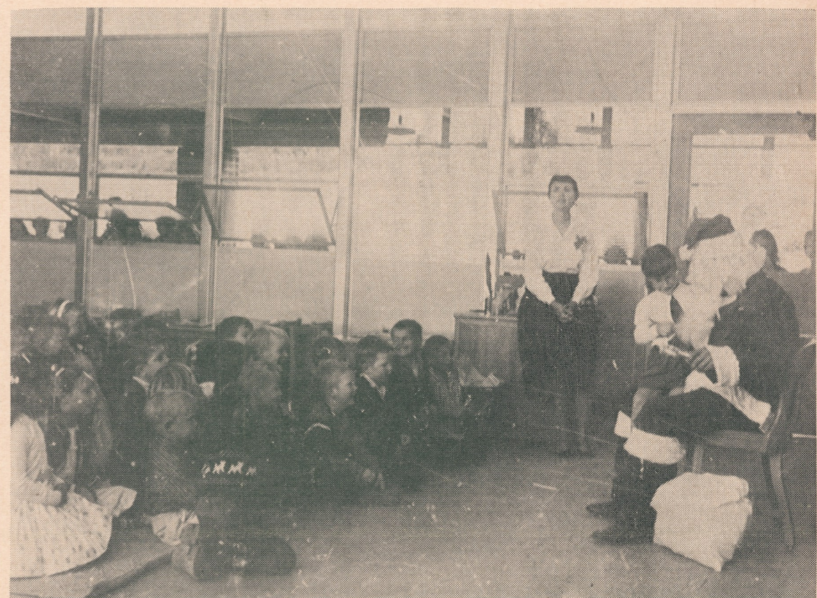
AND HAVE YOU BEEN A GOOD GIRL? — Naturally enough, she had, as had all the other youngsters interviewed by this merry old gentleman from the north pole. This scene, taken in the kindergarten room of the Rancho Santa Fe school reflects the entire Yuletide spirit on the ranch —proving that snow or no, Santa keeps his appointments.