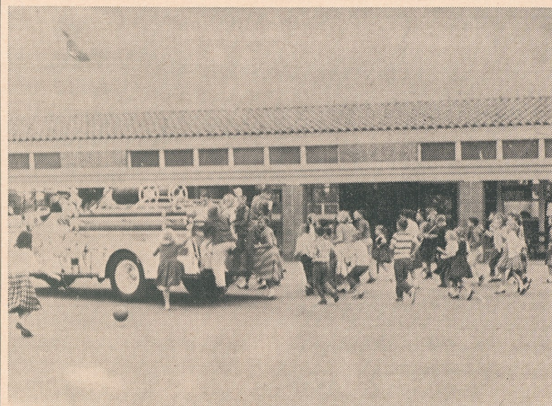
ABOVE — No sooner had Santa arrived at the Rancho Santa Fe school—fire siren going full blast—than kids came from every direction, proving that he is a very popular gent indeed among the younger set. The ball game stopped in mid-inning and the ball forgotten in the excitement.