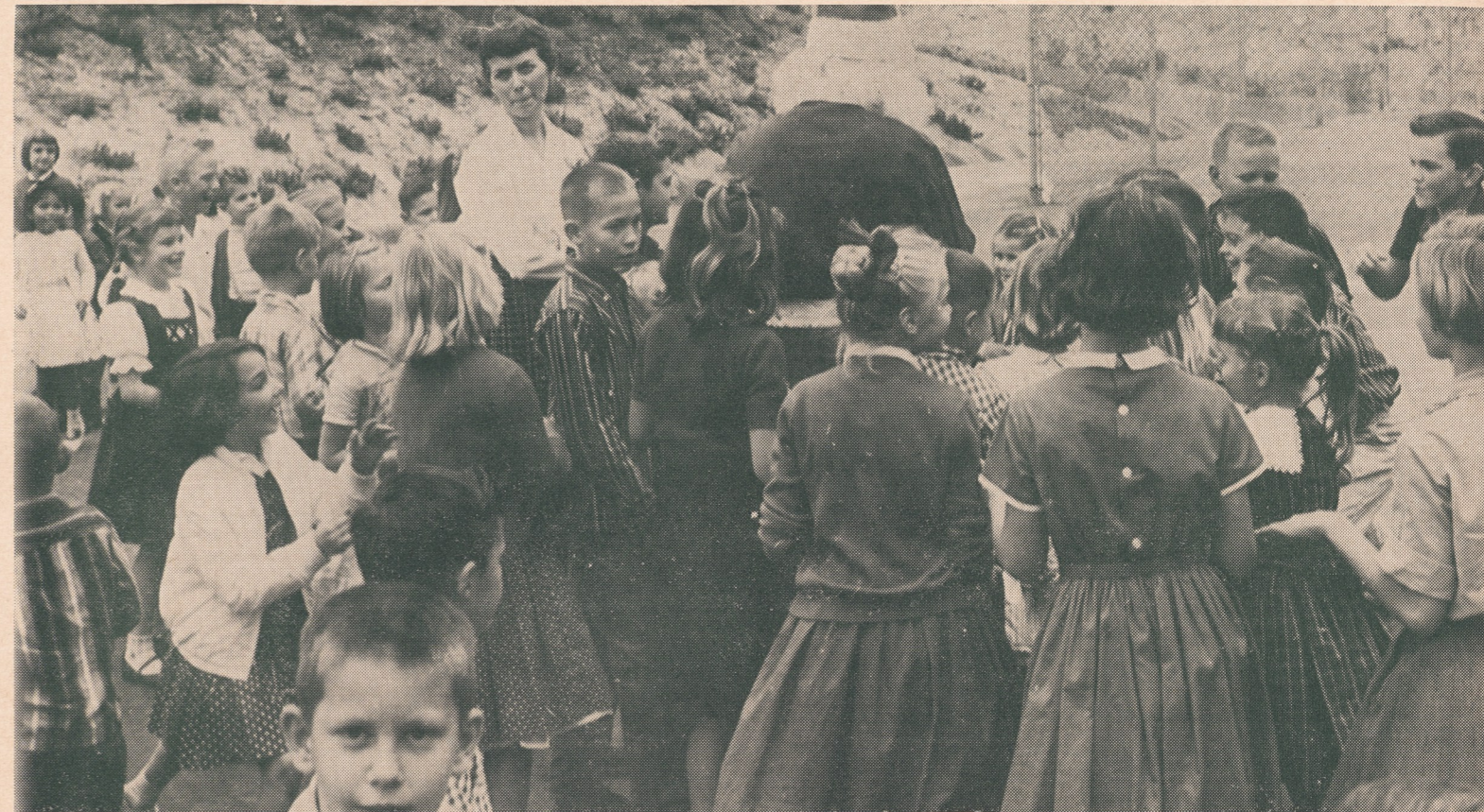
POPULAR FRIEND — There is perhaps no more popular fellow around than St. Nick at this time of year, however popularity such as this has its drawbacks. For one thing, it's hard to breathe inside that suit and behind those whiskers without having all available oxygen being used by enthusiastic supporters. But everyone had fun including Santa himself—although last reports indicate he looked a little wan after the Rancho Santa Fe ordeal.