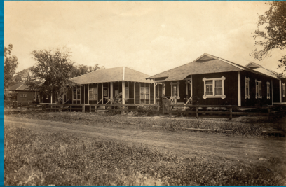
Saint Elizabeth's Mission cottages, circa 1906. The affordable housing development on the Saint Elizabeth's Mission grounds consisted of cottages for married couples and young families, and a two-story dormitory for single men. By 1927, there were a total of seventy-six cottages. They occupied the area across Kanoa Street between Pua Lane and Banyan Street and the site where the present church now stands.