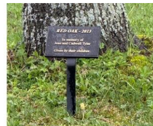
Custom plaque to be similar to above