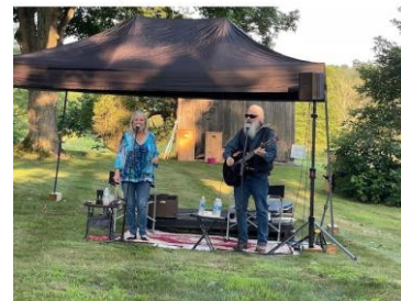
Music by Oxford Station Band

Friday night - House tours & Genealogy & Registration at 5:00 PM, Pizza and music from 6 - 8pm