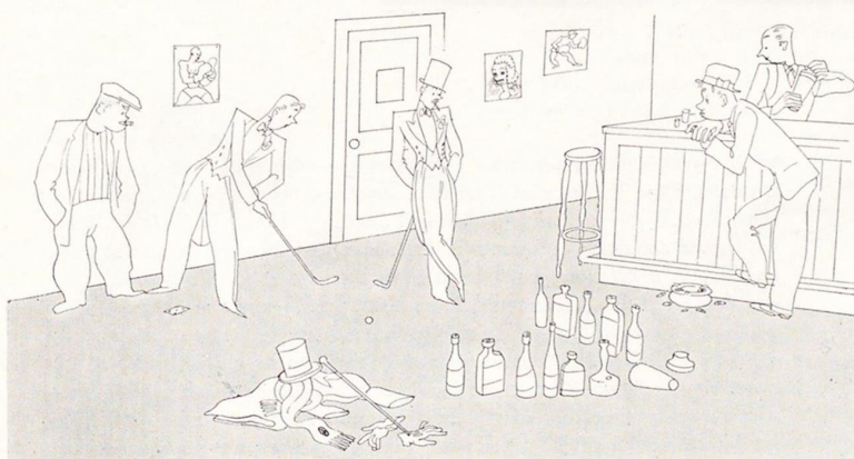
The Nineteenth Hole in the Speakeasy

Again, there is the School-Teacher Player, who knows just as well as you and I, or his youngest child, that three and two make five, but who, in a loud, monotonous, and cheery voice, counts out every throw something like this: "Well, there's my three, and there's my two! And here's a four, and there's a six. And that's one one , (Continued on page 108)