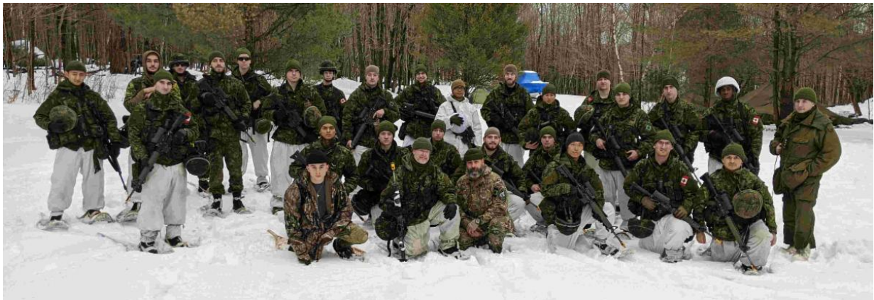
RMR troops posing with their survival skills instructor on Ex BRASS MONKEY 2020.