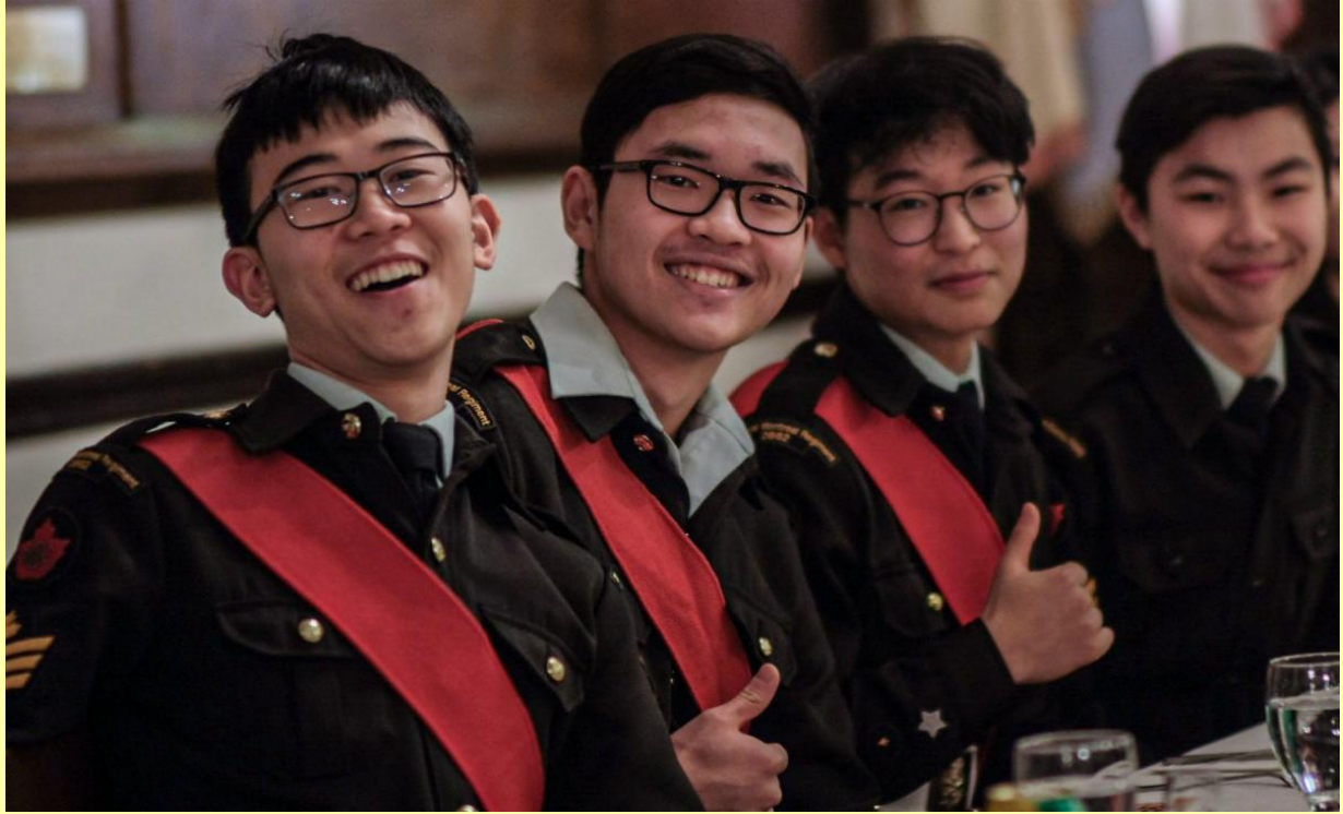
Cadets from 2806 Pointe-Claire enjoying themselves during happier times at a RMR cadet mess dinner in February 2020.