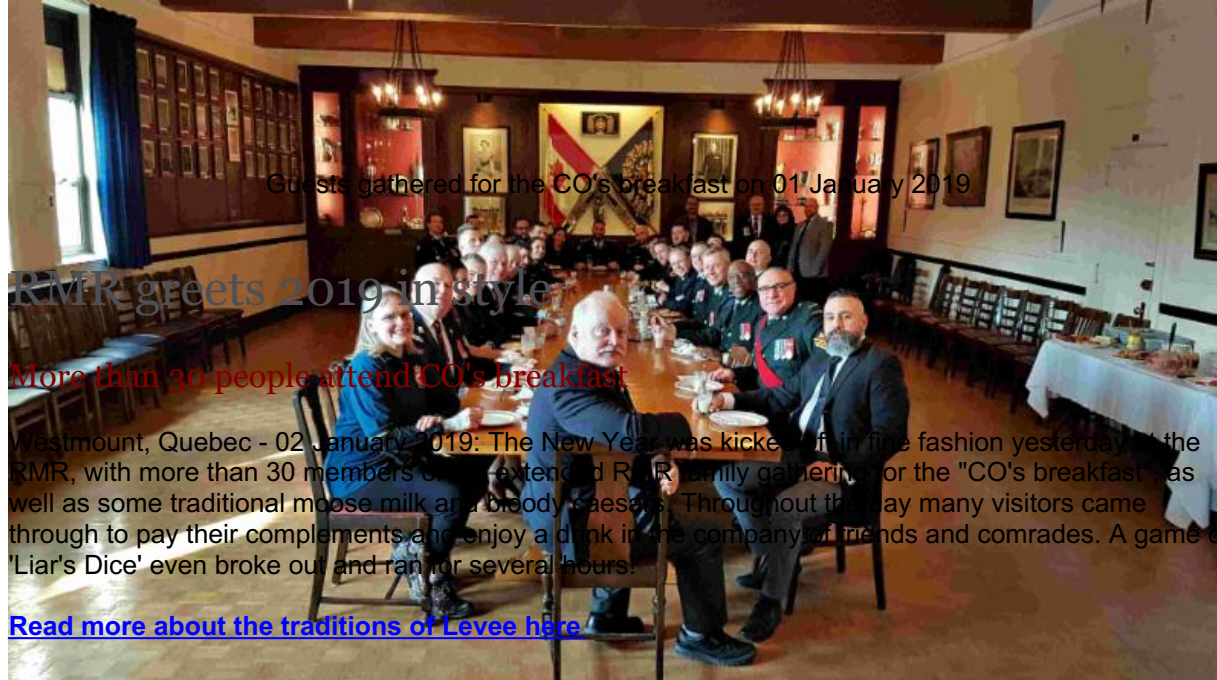
Guests gathered for the CO's breakfast on 01 January 2019