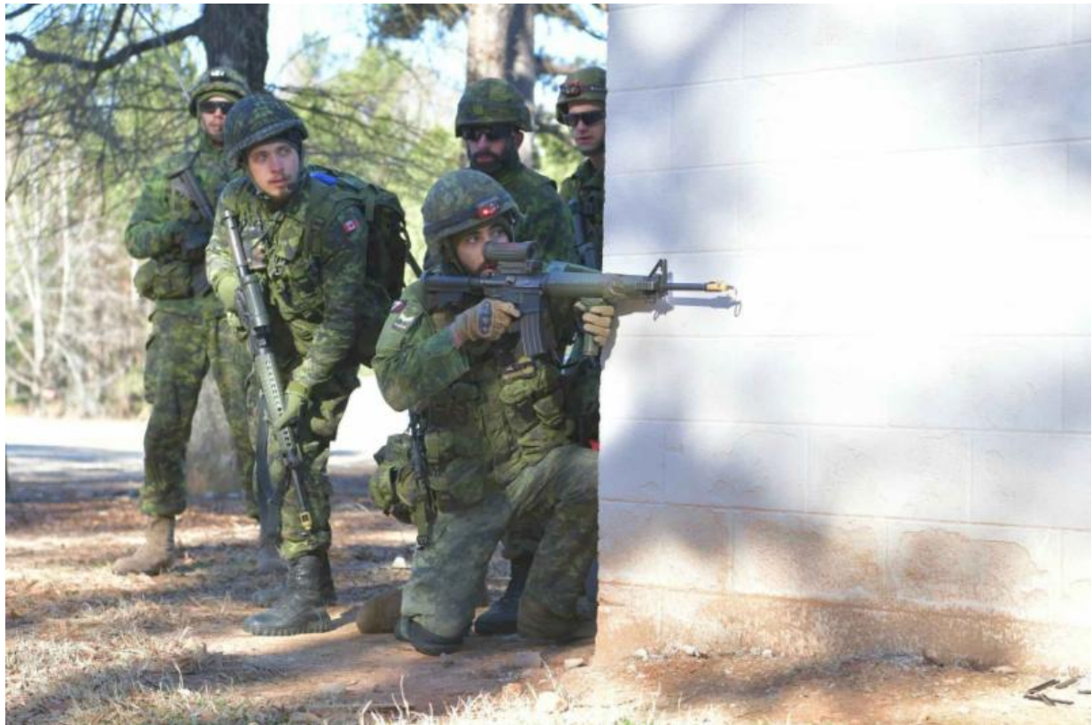
RMR soldiers fighting through their objective in Fort Pickett, Virginia, USA.