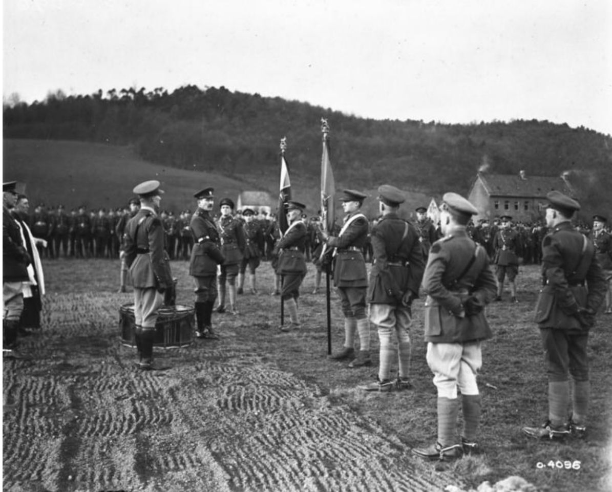
Presentation of Colours by H.R.H. Prince Arthur of Connaught, 04 January 1919 at Unter Eschbach, Germany.