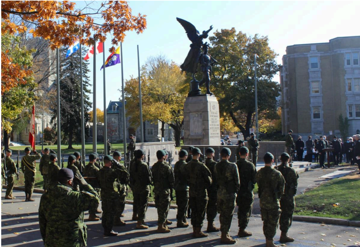
11h00 at Westmount cenotaph in Vimy Park, Saturday 06 November 2021.