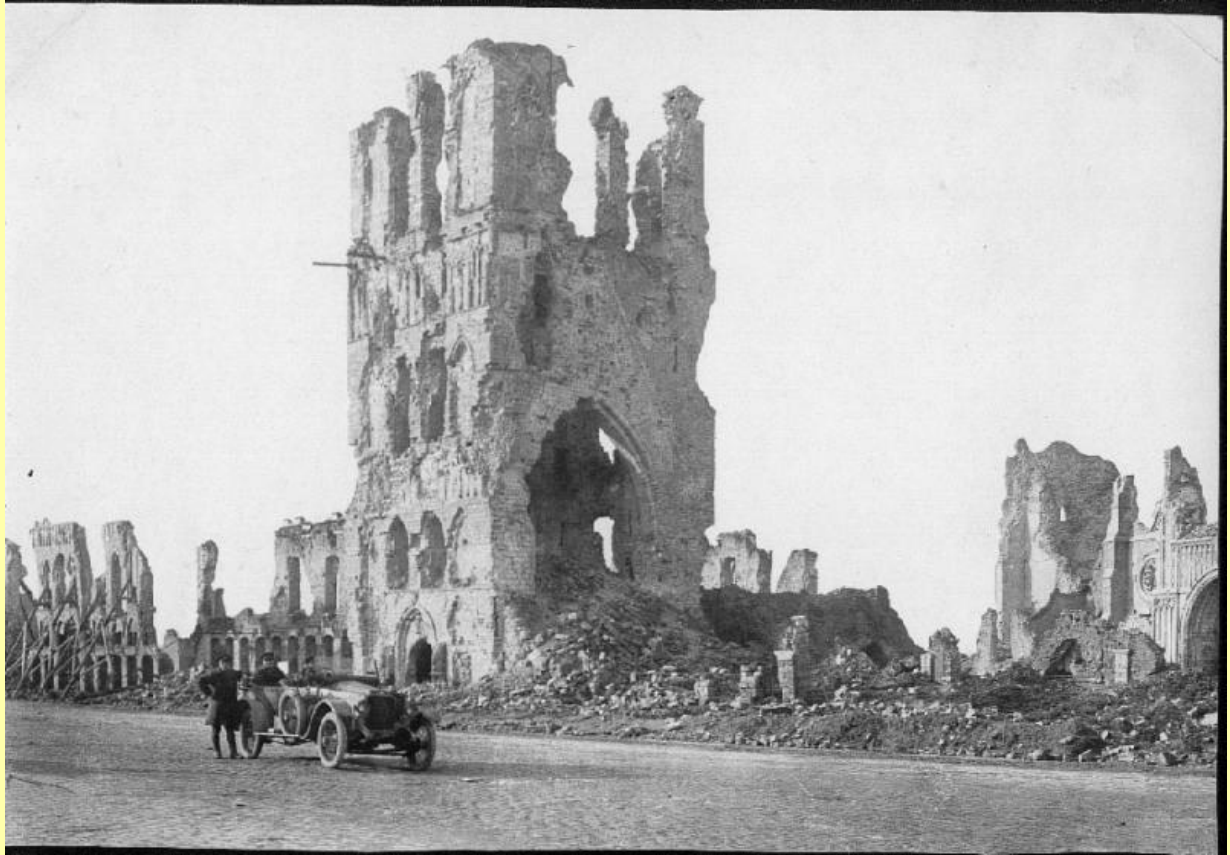
Ypres after the war