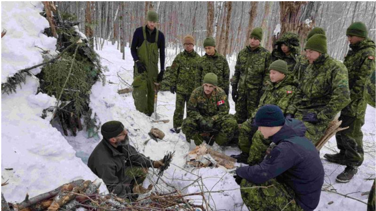
RMR soldiers listening to their winter survival instructor on Ex BRASS MONKEY