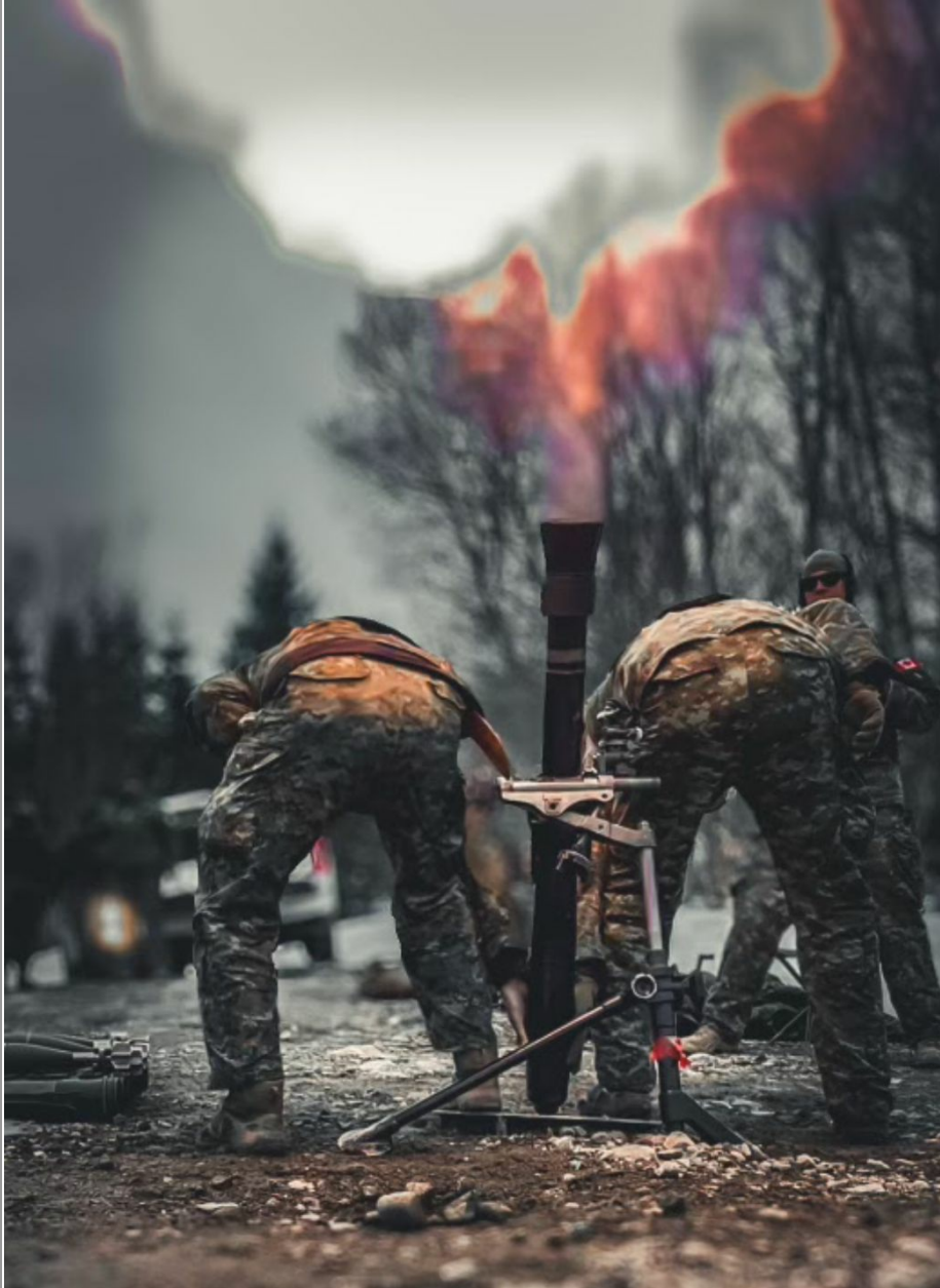
RMR members firing a COORD ILLUM mission during a live fire exercise held in Valcartier from 08 – 10 March 2024.