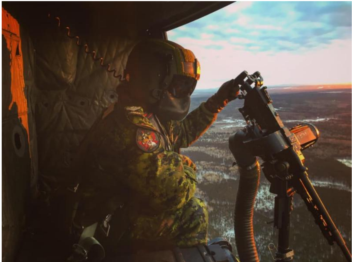
Master-Corporal Brigitte O'Driscoll on a training flight