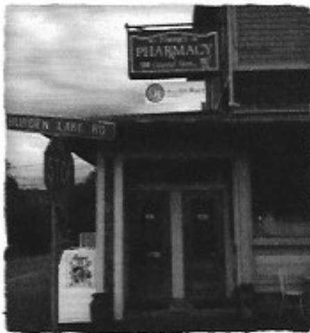
Young's Pharmacy & General Store

Last, but certainly not least, I would recommend going to The Towne Tavern for a beer. It's a low-key spot, with great food and really nice bartenders. The atmosphere, however, is why I go there. It looks like a pine tree exploded inside. Beautiful planks of pine all over the place. So comfortable, and rustic, and woodsy. It just feels right. Plus it's a nice change of pace from the other bars in Albany. We were supposed to have our Bombers holiday party there last year but the night of the party Albany had the winter's worst snow storm and we had to cancel.