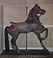
Mascol, restored to original magnificence

When the trolley line ran from Troy to Averill Park, Crystal Lake was referred to as "Uptate Coney Island". A population explosion occurred during the summer months. For some it was a one-day round-trip trolley ride from Albany on the outskirts of Troy, or at a later date, a United Traction Company bus ride. Others would stay at hotels in the area for extended vacations. Fishing, hiking, boating and camping were available at the seven lakes within the town and could be interspersed with visits at Crystal Lake for rides on the carousel, swing, Ferris wheel and miniature train ride.