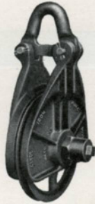
S317B S400B S430B