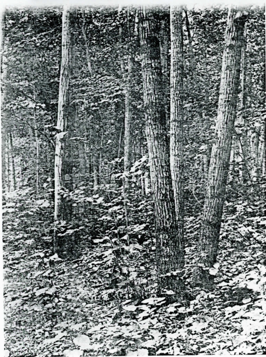
Hardwood Stand, Needing Moderate Thinning (page 24)

2,200,000; Mississippi, 17,500,000; North Carolina, 19,000,000; South Carolina, 12,000,000; Tennessee, 15,000,000; Texas, 30,000,000; Virginia, 14,000,000, and West Virginia, 9,100,000 acres. These forests should be so used that the very most may be made from the annual cut, while at the same time the cut is being replaced by new growth, thus insuring a perpetual source of wealth.