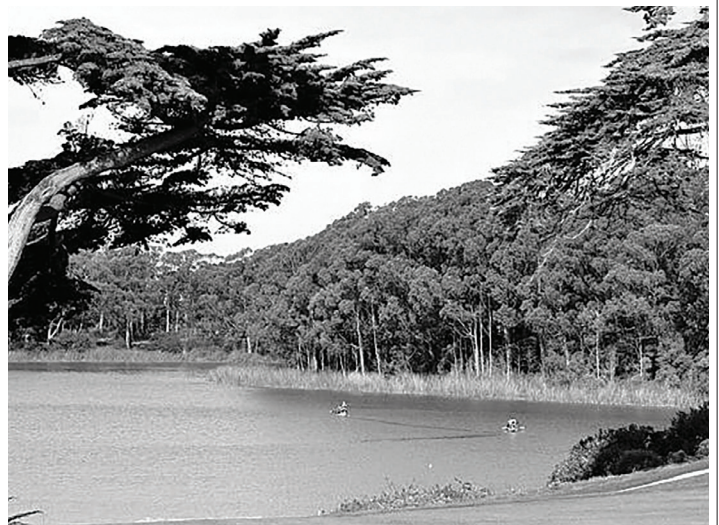
Lake Merced, home of the freshwater Dolphin Club.

Dolphin Club Annual Meeting 6:30 pm Weds Oct 20, 2021 Live and/or Zoom