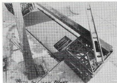
The Dolphin Club's new interpretive historical plaque on the wall (top) and dedicated public access plaque embedded in concrete (below).