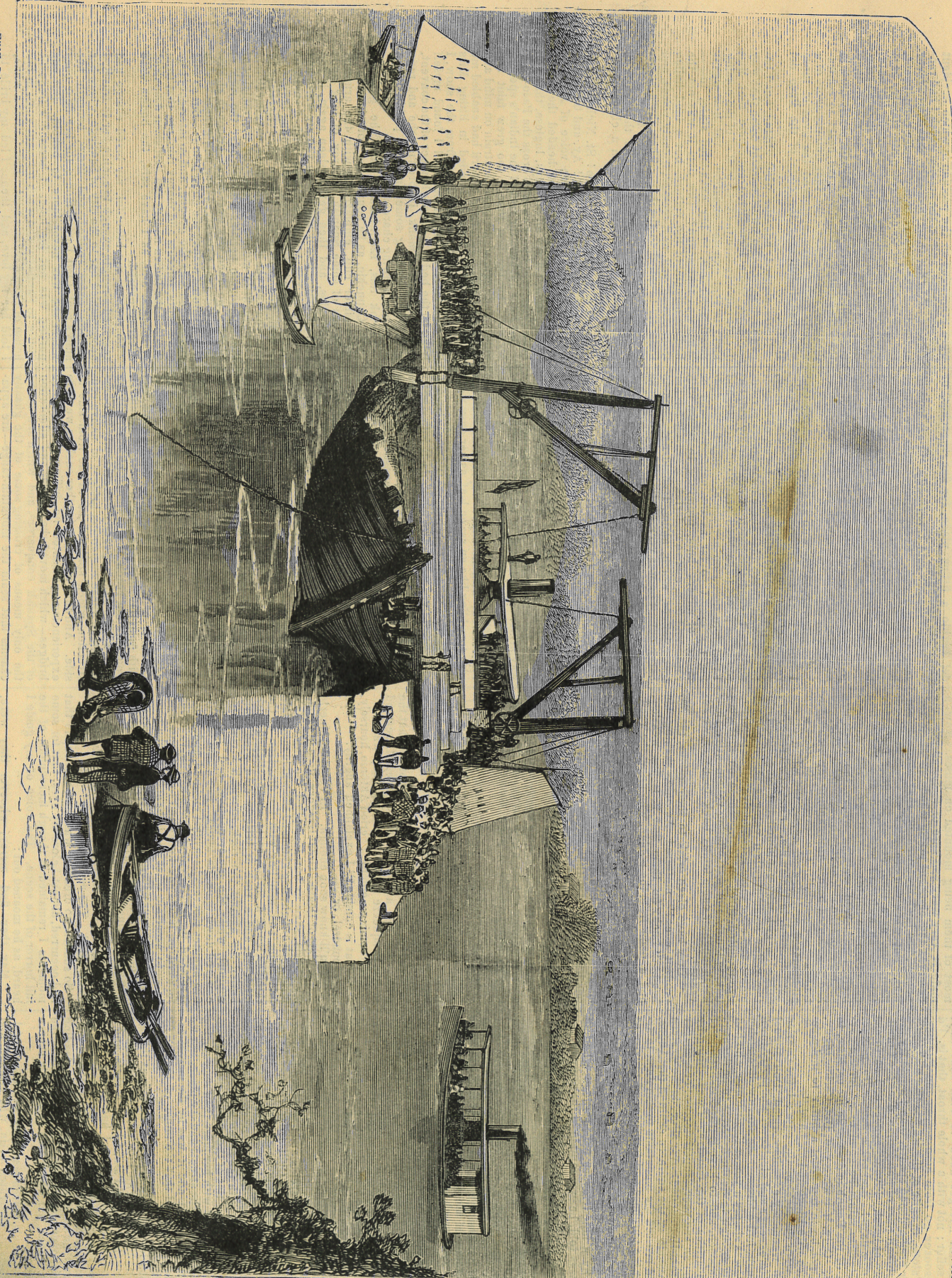
ERIE, PA.—COMMODORE PERRY'S FLAGSHIP, THE "LAWRENCE," RAISED SEPTEMBER 13TH, AFTER LYING SUNK IN MISERY BAY, LAKE ERIE, FOR SIXTY YEARS. —SEE PAGE 55.