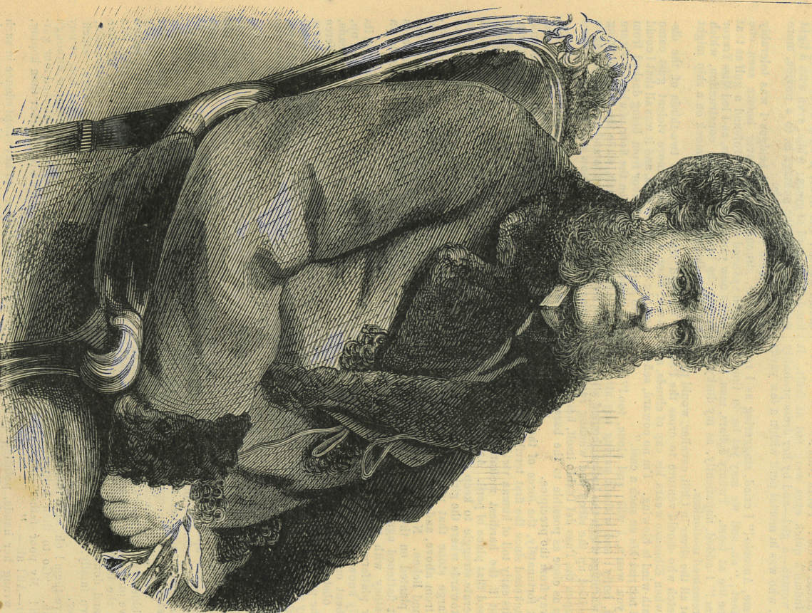
HON. JOHN BIGELOW, NOMINEE OF THE DEMOCRATIC CONVENTION FOR SECRETARY OF STATE OF NEW YORK.—SEE PAGE 55.