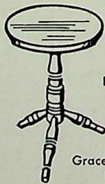
Graceful colonial table