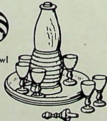
Turned wine set