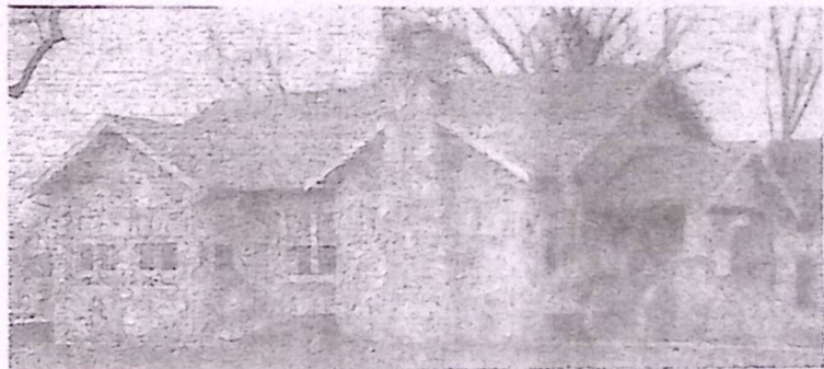
Chet Williams' home, 603 West street.

It, too, has an attached garage. The kitchen is large and "super-complete," with commodious built-in cupboards to delight the eye of any housewife. The home is completely insulated and has a full cellar, so nicely finished that it, itself, would comprise fine living quarters.