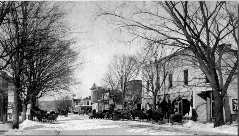
Butler Street looking north ca 1912