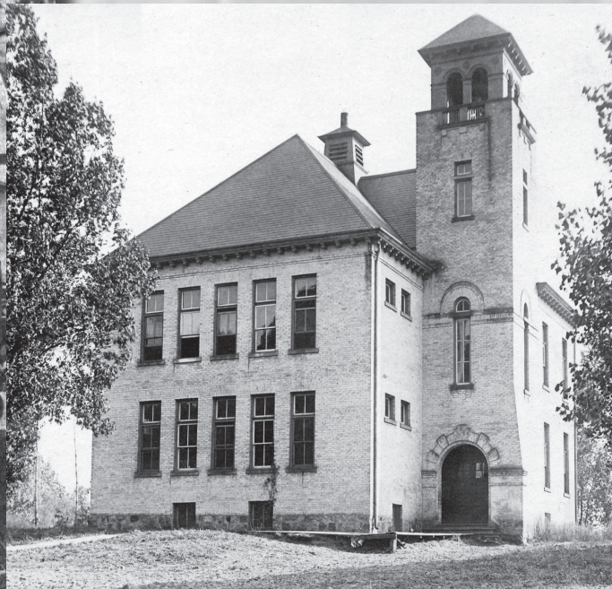
Top - The first Saugatuck Union School ca 1880 on top of Old Allegan Rd hill