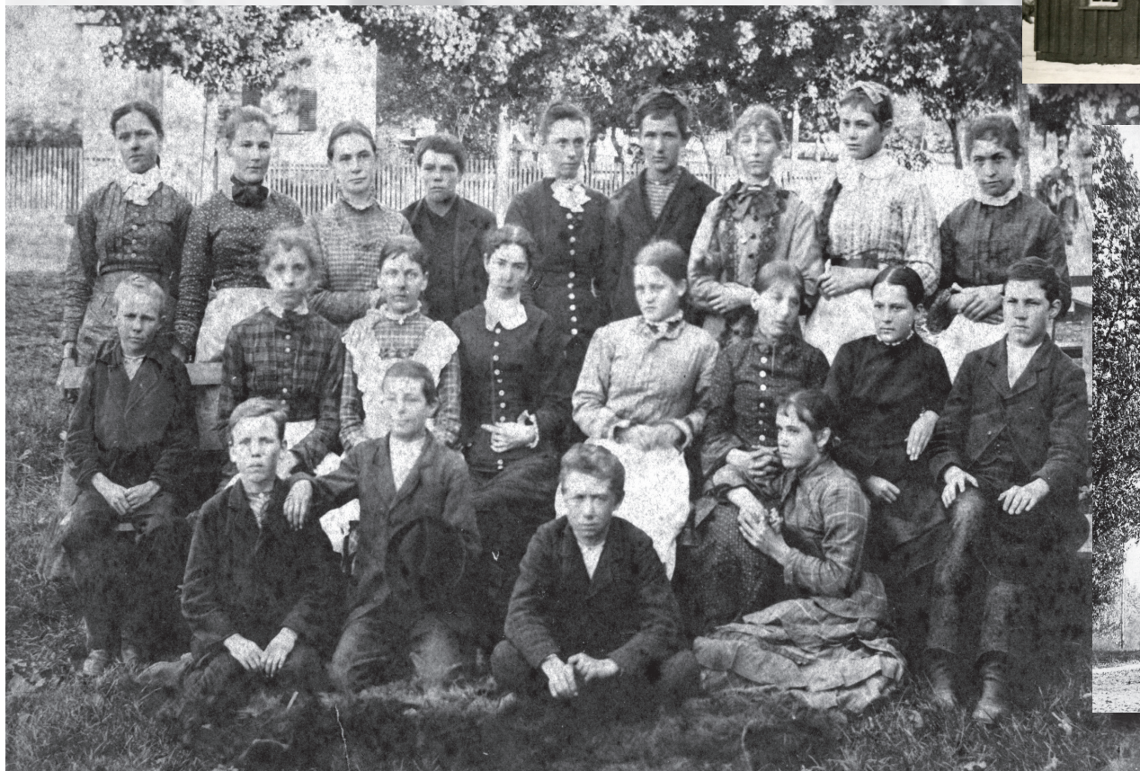
Above - Saugatuck students 1880