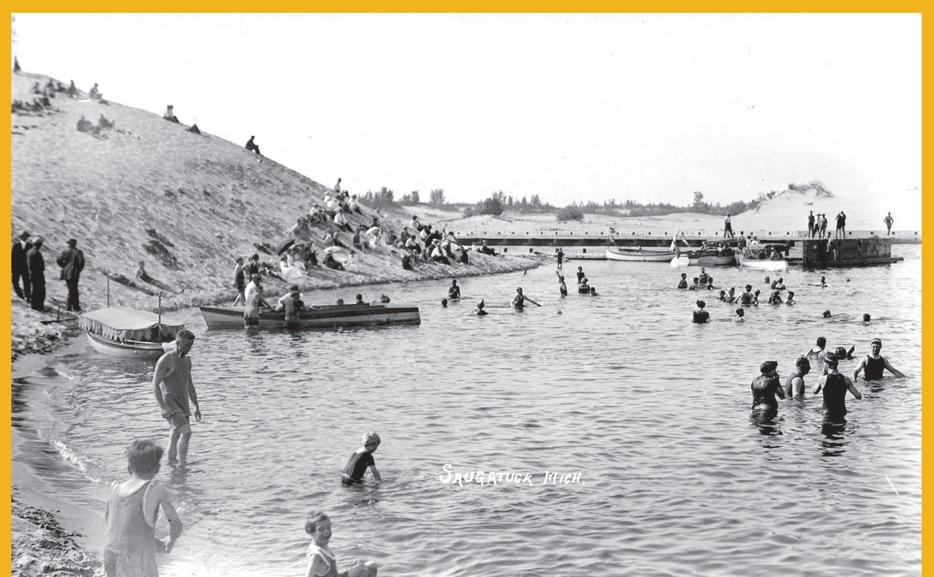
Swimming at the Basin

Early beachgoers often preferred to swim at the mouth of the river, in an area called the "basin" instead of in the waters of Lake Michigan. In 1906, when a new river mouth was cut for the harbor, a large area was left open just before the entrance for this purpose.