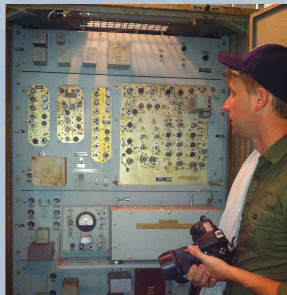
AN/FPS-18 radar receiver.

The white radar dome is an iconic landmark visible for miles in all directions and used as a navigational aid for mariners seeking Saugatuck or nearby ports.