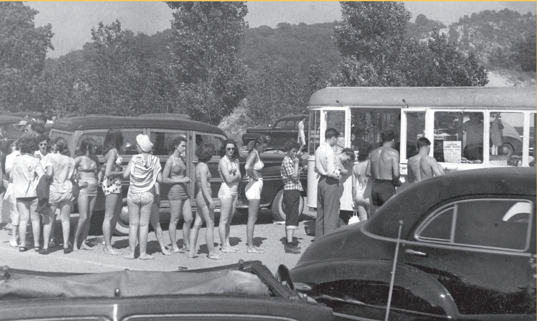
Beachgoers lining up for fresh popcorn and other concession treats. In 1957, a tornado razed both the full-service Beach House (shown at right) and the decommissioned Saugatuck lighthouse.

Oval Beach has offered many amenities to visitors over time. Bathhouses were first built going back to the days of excursion boats at the “basin”. Refreshments were offered on site, and for many years Alice Pluim operated a concession trailer and later a stall in the beach house.