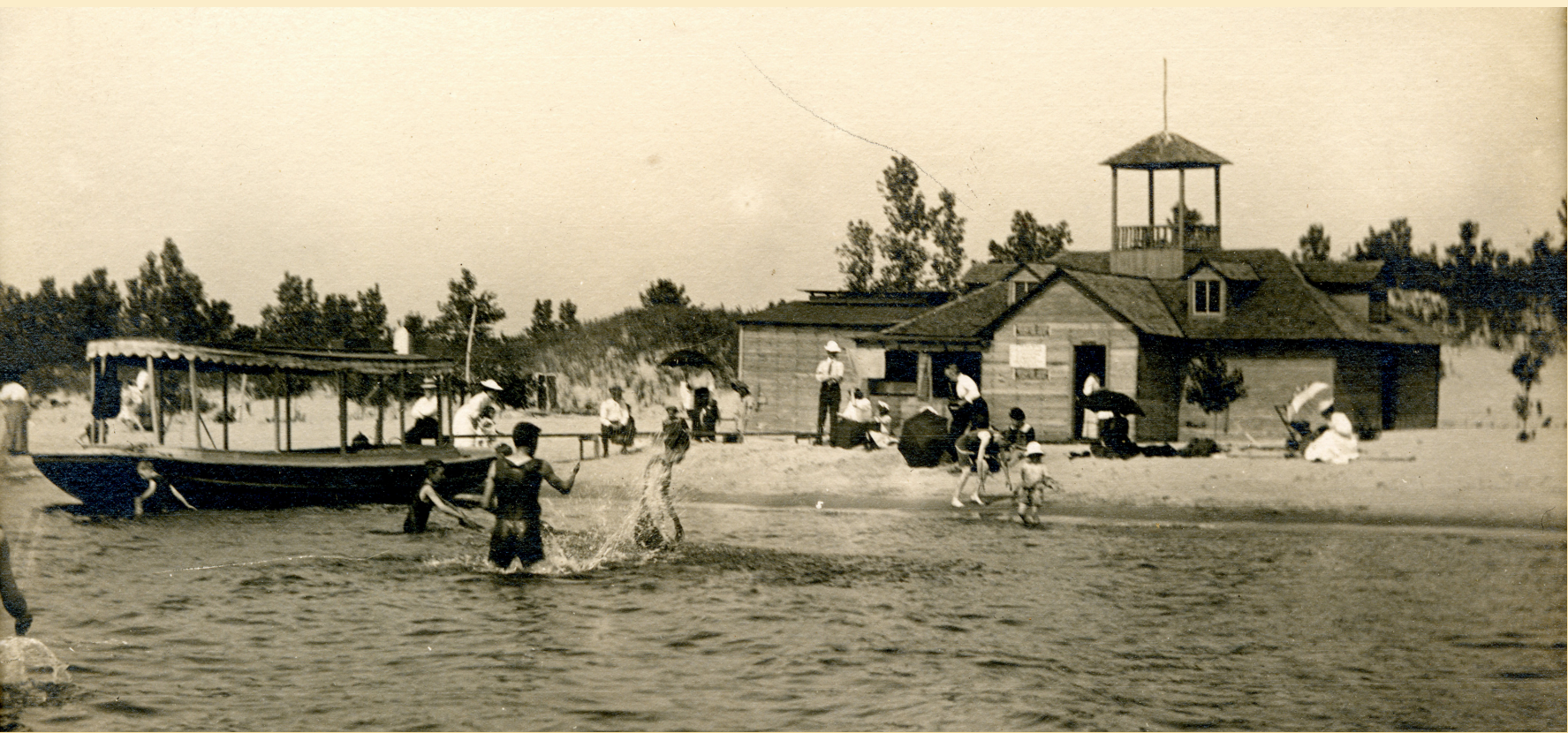
The Bird Bathhouse, circa 1905, was north of Oval Beach and only accessible by boat, rustic road, or a long climb over Mt. Baldhead.

Oval Beach has offered many amenities to visitors over time. Bathhouses were first built going back to the days of excursion boats at the “basin”. Refreshments were offered on site, and for many years Alice Pluim operated a concession trailer and later a stall in the beach house.