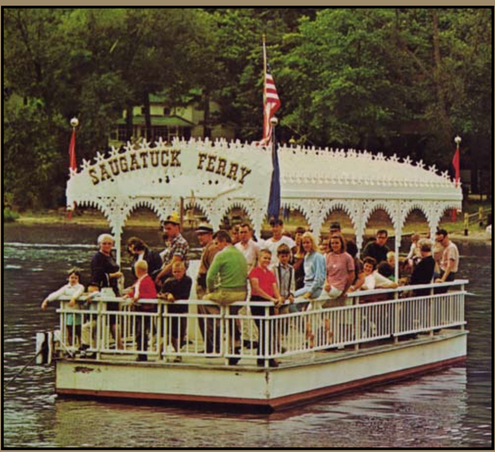
Summer crowds enjoy a trip on the chain ferry.