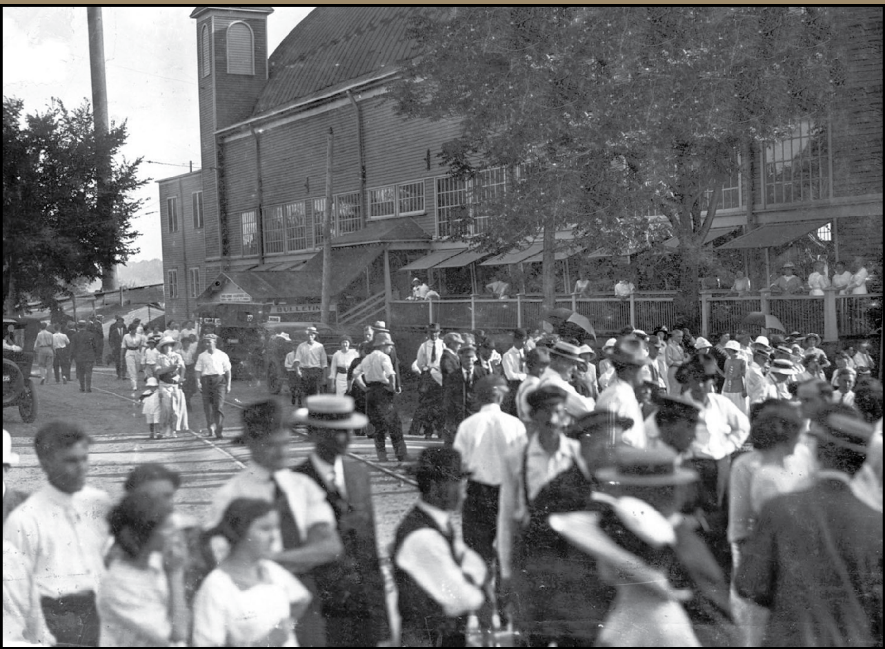
As early as 1915 when this picture was taken, it was evident that the population of the area increased as the weather got warmer.