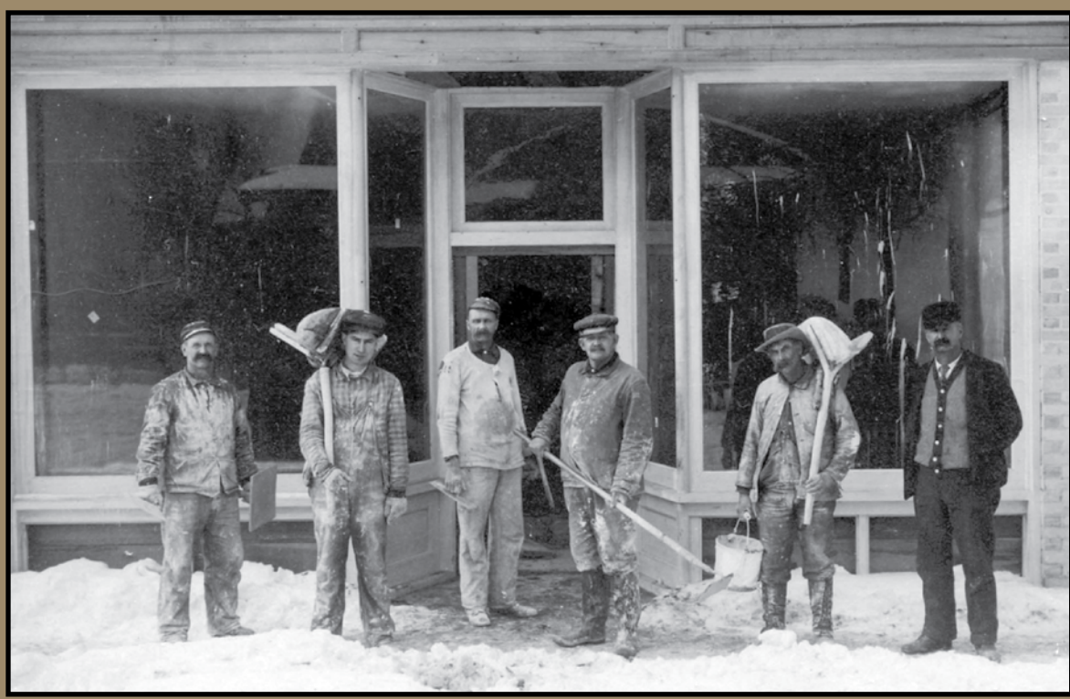
During the winter, the crews and builders worked on other projects. Here some construction workers put the finishing touches on a Butler Street building.