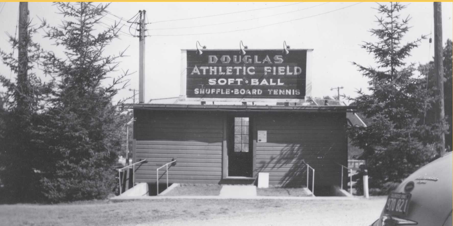
In 1935 a grant from the Works Progress Administration (WPA) funded site updates for continued community use.

Sporting events and activities have been held in this field since the 1860s. By the 20th century it was the only diamond around with dugouts and running water for the teams, protective fences, spectator seating, lighting for night games, and a press box. Facilities over time have included baseball and softball diamonds, tennis courts, shuffleboards, and playgrounds.