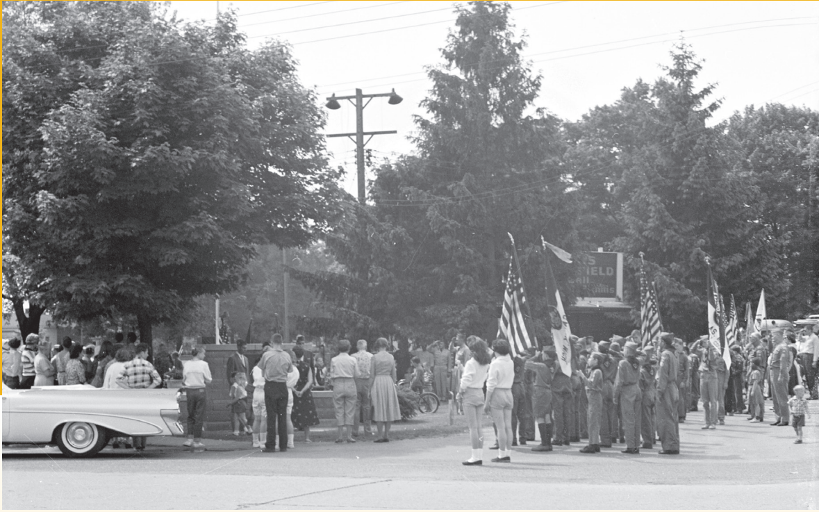
In 1944, an honor roll listing the names of those from Douglas who served in World War II was installed. In 1953 it was replaced by the veteran's memorial monument at the northwest corner of the block.