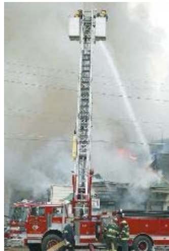
AIR ATTACK: Saugatuck Township firefighters extinguish the fire on Center Street in Douglas Wednesday.