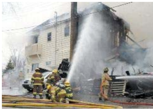
FROM THE GROUND: Firefighters douse the fire in downtown Douglas Wednesday.

"This was my retirement," she said of the building. "I have no idea at this time what