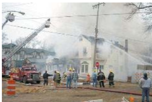
Saugatuck Township firefighters extinguish a fire at Center Stage Salon in Douglas on Wednesday after the building exploded.