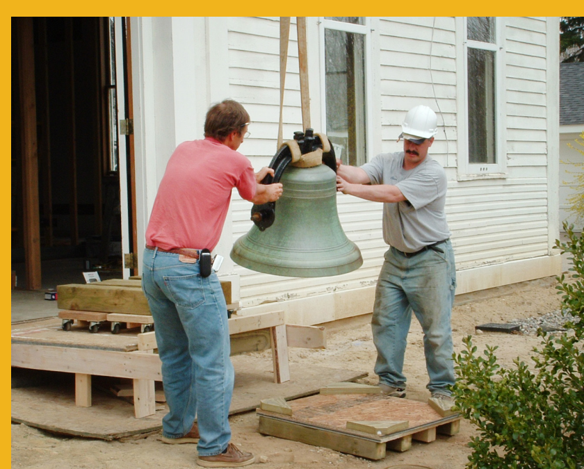
The bell was hoisted to the restored schoolhouse belfry and today it is rung to mark special events.