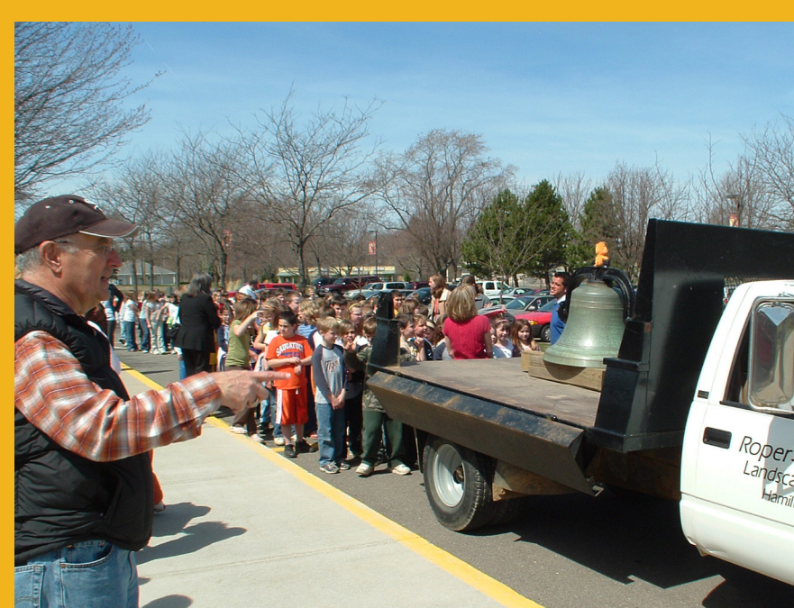
In 2008, the original 1892 bell was returned as a gift from the children of the Douglas Elementary School.

Under threat of sale and demolition, the Saugatuck-Douglas Historical Society reached an agreement to purchase the building, restore it, and use it for the Society's expanding community heritage programs and archives. The $1.4 million restoration project was completed in 2012 thanks to hundreds of donors and volunteers.