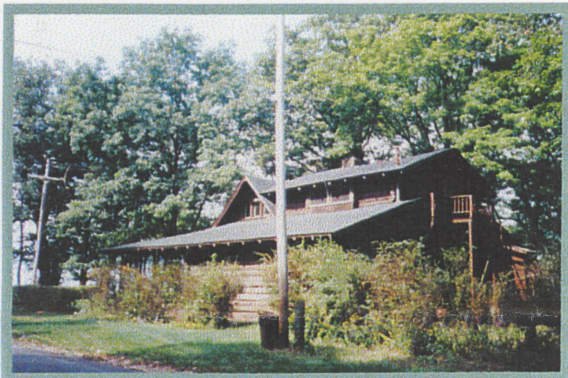
Orchard Cabin, Looking Toward the Lake