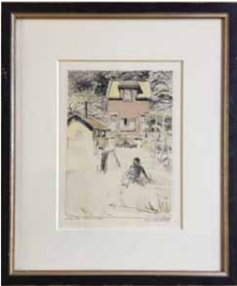
ARTIST AND MODEL | Elsa Ulbricht | 1934 16" x 19" | color lithograph $300

Location unknown, possibly Log Cabin Bar or Sandbar, Saugatuck.