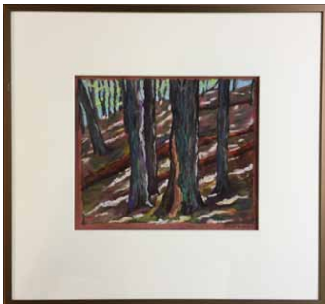
WOODS WALK | Teresa O'Brien | n.d. 19" x 18" | oil pastel on paper $250

Illustrations depict attractions in 21 towns along the Lake Michigan shore, including Saugatuck's Big Pavilion.