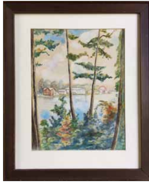
KALAMAZOO RIVERFRONT | Ellen Larson | n.d. 13" x 16" | watercolor on paper $150

Lakeshore Chapel, Campbell Road and Lakeshore Drive, in Shorewood. Description on back.