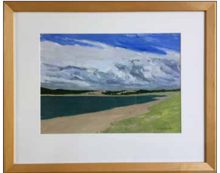
LAKE MICHIGAN & DUNES | Cathy Van Vorhis | n.d. 22" x 18" | acrylic on panel $200

A painter painting the model with an Ox-Bow cottage in the background.