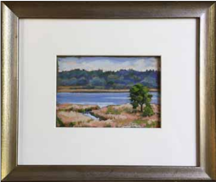
THE KALAMAZOO FROM THE RED HOUSE Anne Corlett | ca. 2007 16" x 13.5" | oil pastel on panel $500

A quiet corner of the living room of Steven Teich's house on Simsonson Drive, Saugatuck.