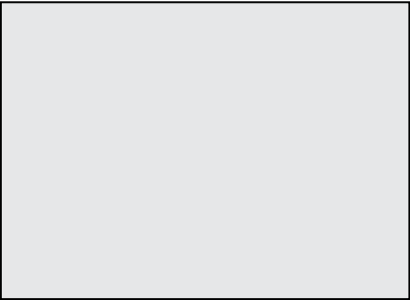
JOHN B. MARTELL HOUSE | Vicky Stull | 1999 19" x 16" | photograph $250