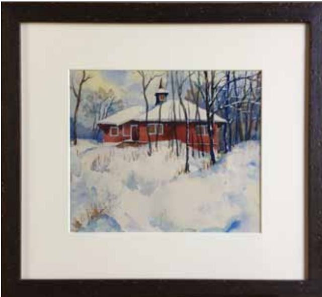
LAKESHORE CHAPEL IN WINTER | Louie Gelin n.d. | 16" x 14" | watercolor on paper $200

Radar station atop Mt. Baldead, looking east from Saugatuck's Oval Beach.