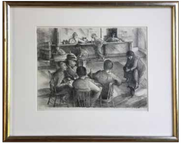
BAR | Elsa Ulbricht | 1938 21" x 17" | prin $300

Location unknown, possibly Log Cabin Bar or Sandbar, Saugatuck.