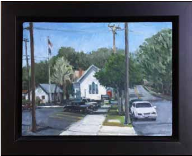
WHITE CHURCH | Jeff Abshear | n.d. 20.25" x 16.25" | acrylic on canvas $900

Looking north towards the Methodist Church, Griffith Street, Sautauk.