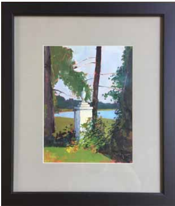
FINIAL | Holly Leo | n.d. 17" x 20" | arylic on panel $250

Harbor scene, North Water Street, Douglas.