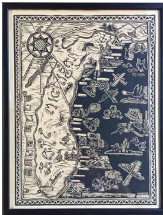
LAKE MICHIGAN MAP | Artist Unknown | n.d. 14" x 19" | woodblock print $100

Harbor scene, North Water Street, Douglas.