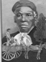
Black Heritage USA 13c