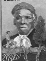
Black Heritage USA 13c