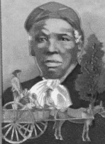
Black Heritage USA 13c