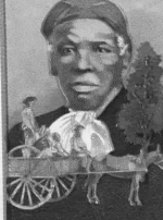
Black Heritage USA 13c