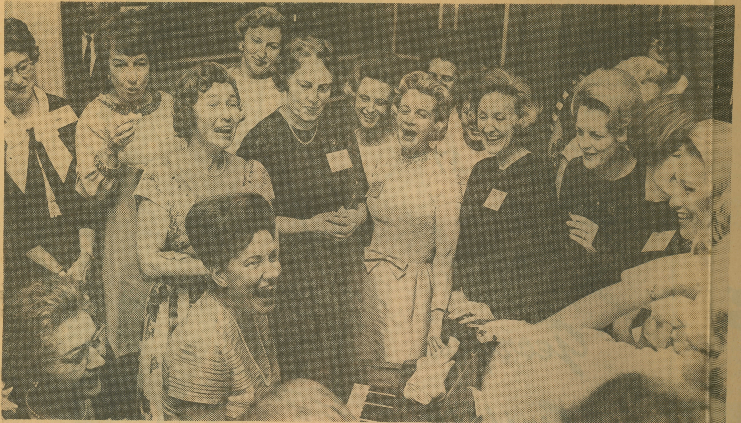
Minnie Pearl (Mrs. Henry Cannon) leads a group in singing old songs around the piano as she did during her school days.