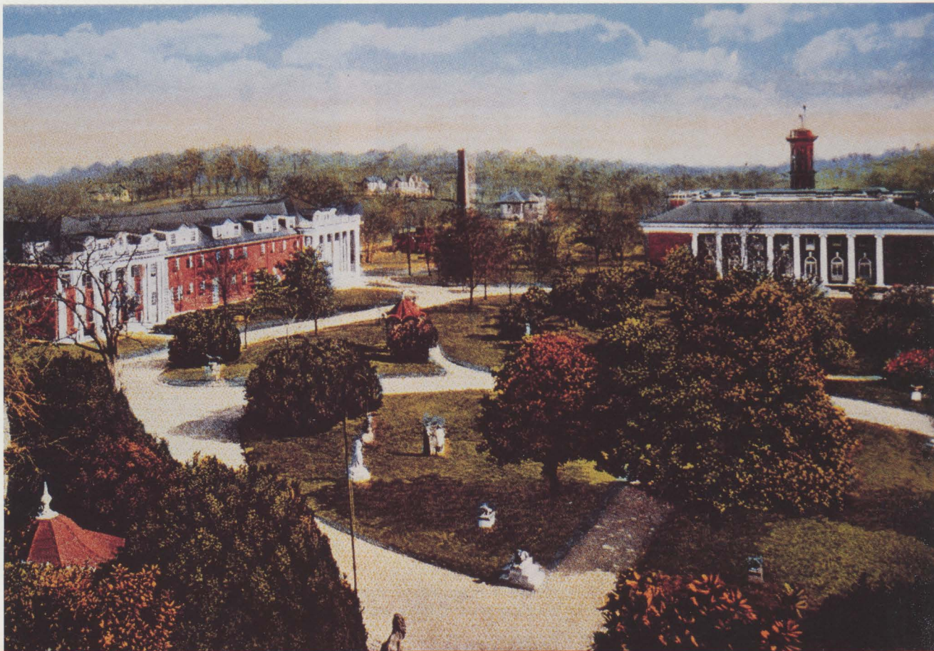
The Ward-Belmont campus, as shown on a postcard, around 1930.