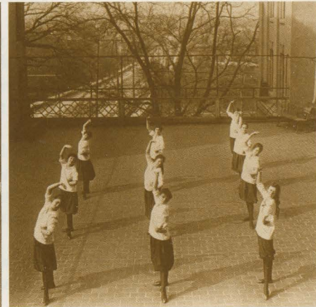
Rooftop aerobics, circa 1920. Sixteenth Avenue is in the background.