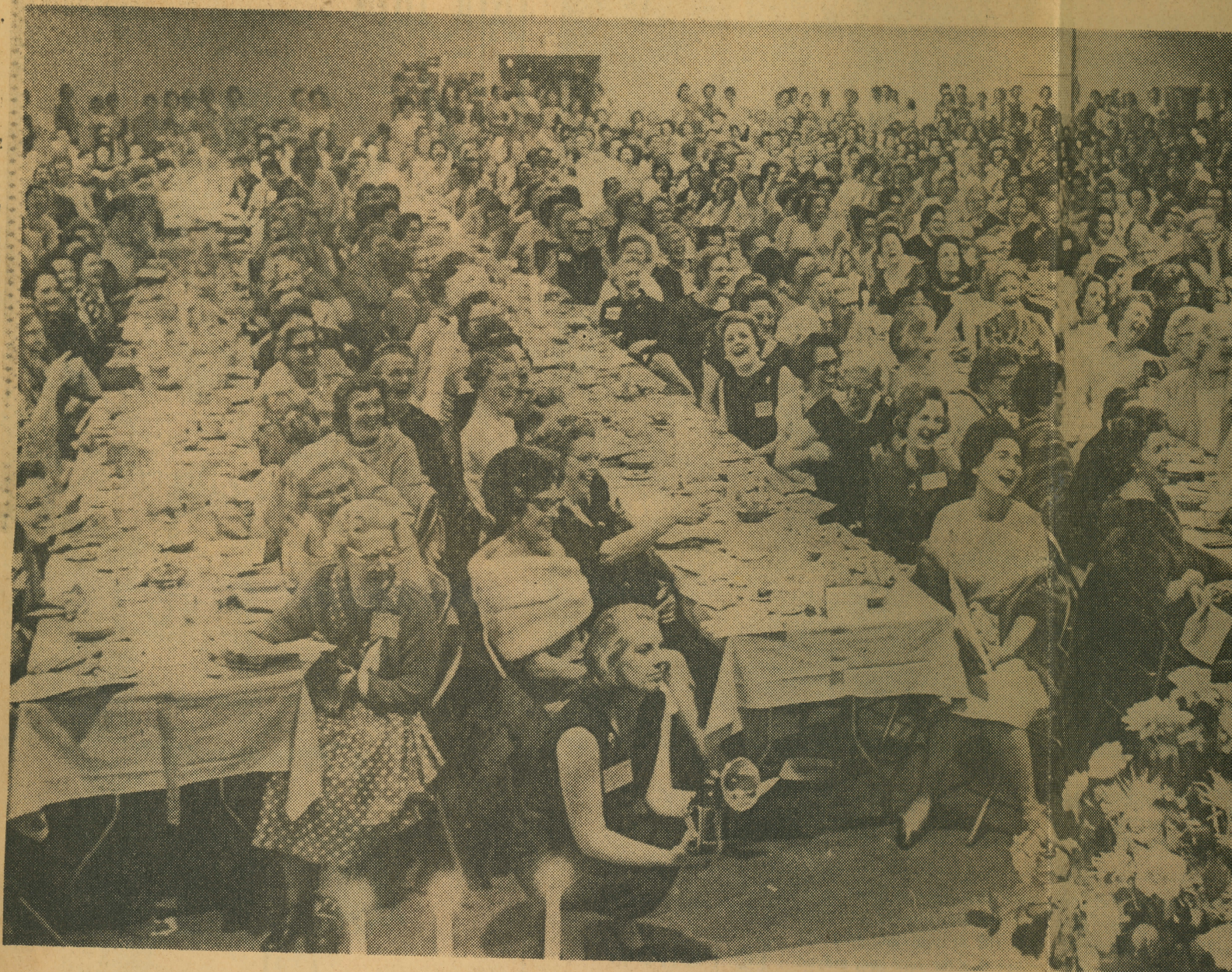
Ward-Belmont alumnae held the first all-class reunion last night since the college closed in 1951. More than 850 gathered at the National Guard Armory on Sidco Drive to attend the dinner which followed a cocktail hour.