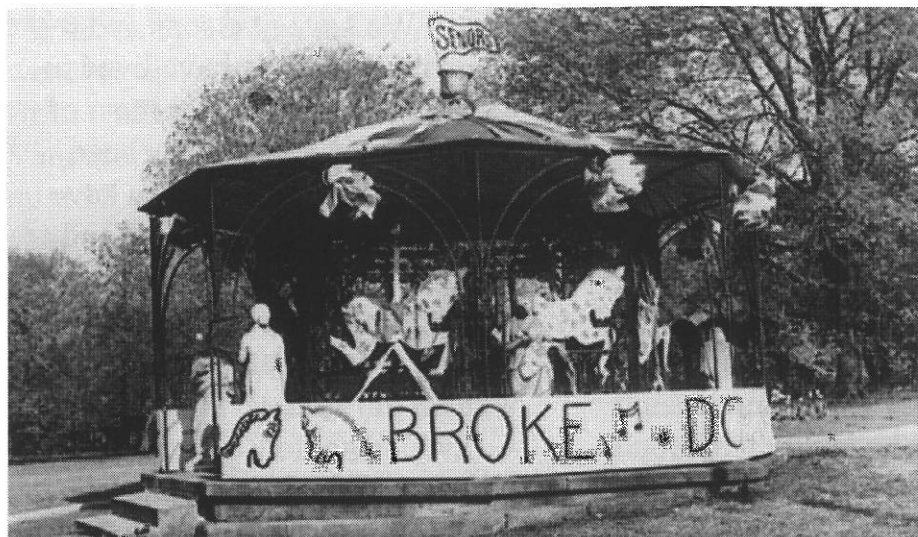
May Day Celebration: Performances of dancing on the lawn and the climax, dancing around the May pole. Fresh flower decorations everywhere. The gazebo was also decorated by the students for this special day.