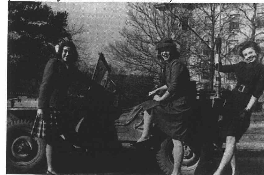
Students posing with a World War II jeep parked on the circle of the campus.