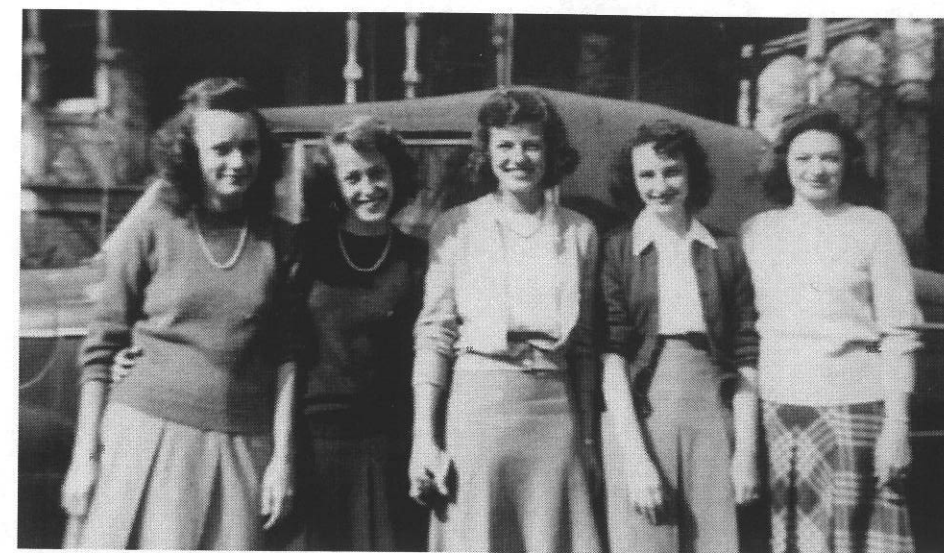
Some of the student Home Economic majors in front of the Home Ec. Building located just across the street on the west side of campus.