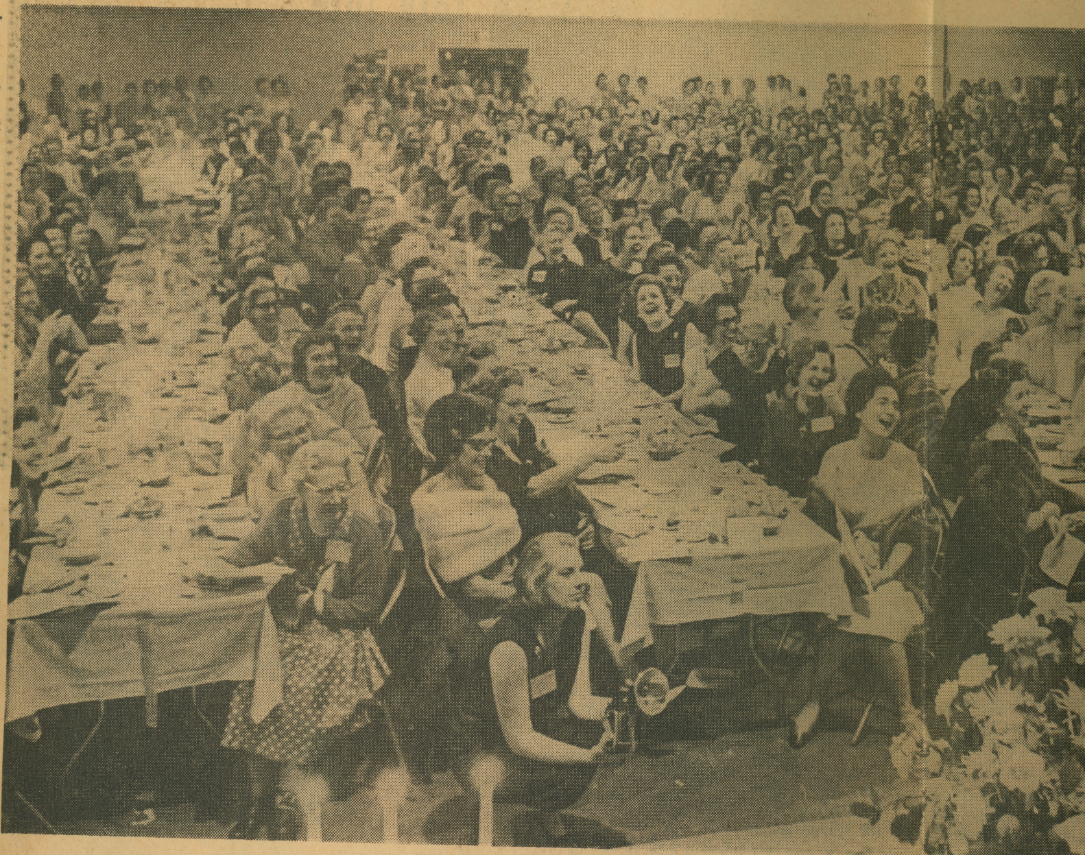
Ward-Belmont alumnae held the first all-class reunion last night since the college closed in 1951. More than 850 gathered at the National Guard Armory on Sidco Drive to attend the dinner which followed a cocktail hour.