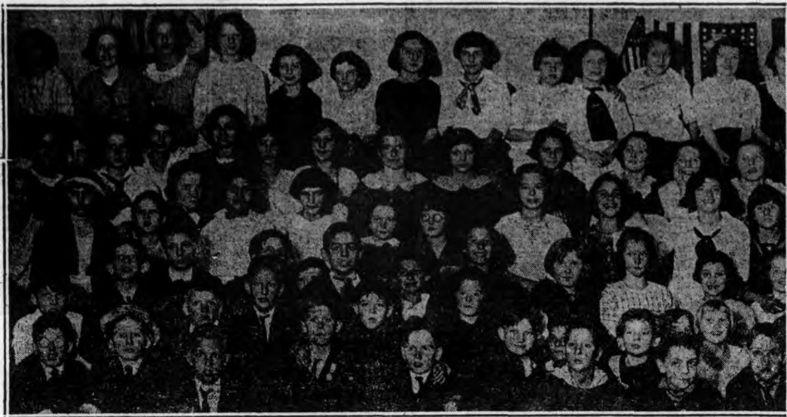
Was held at the Bureau of Charities Building, Livingston street, last evening. About 150 of the youngsters attended.