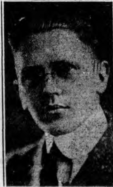
Republican candidate for Assembly in the Ninth District is making a vigorous campaign.