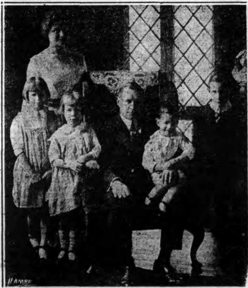
Popular Republican candidate for Supreme Court, photographed at his Staten Island home.