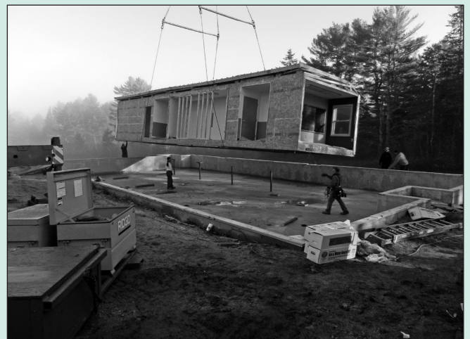
Top: First building section is removed at the Blue Hill site . . .