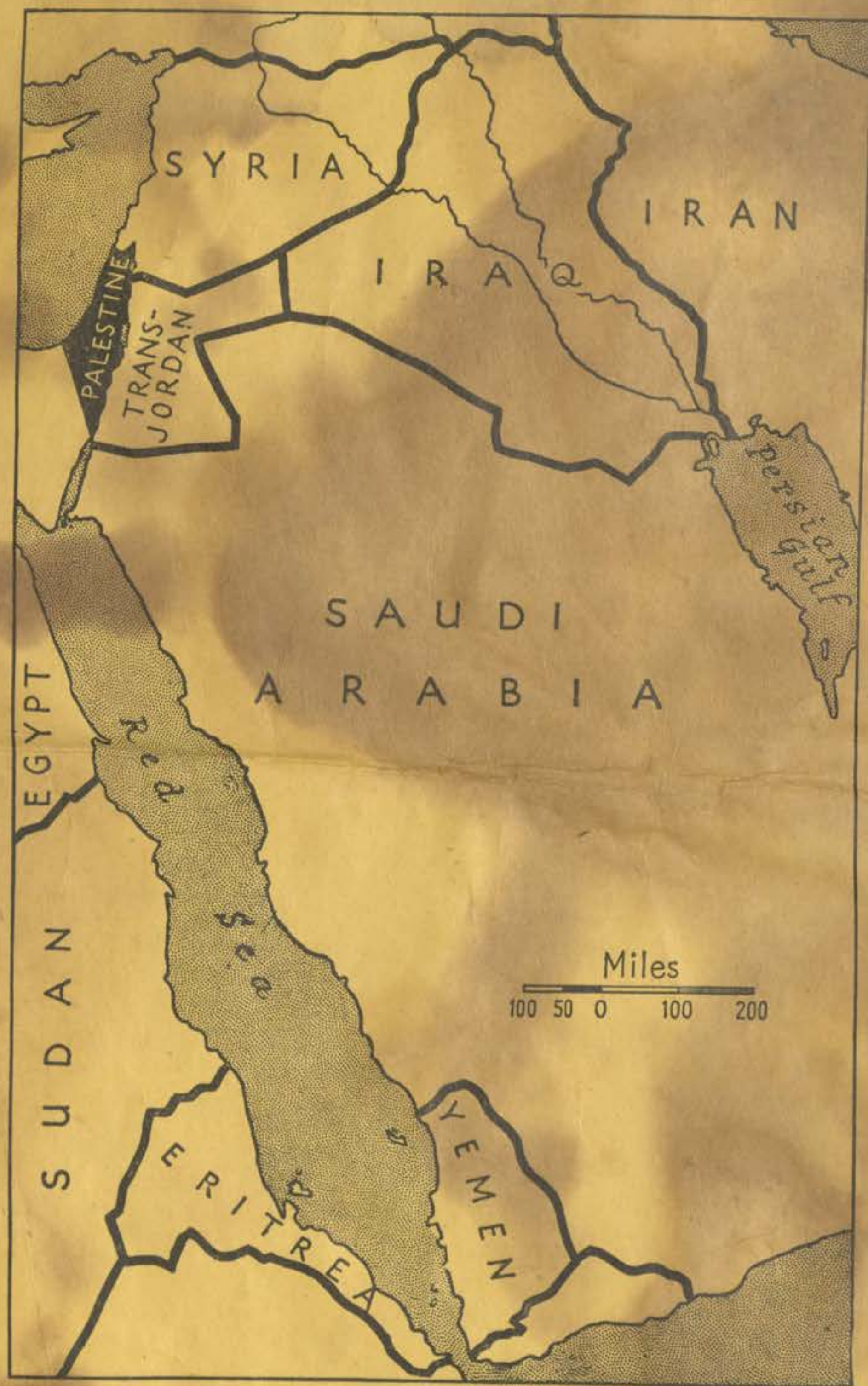
PALESTINE IN THE NEAR EAST

OXFORD PAMPHLETS ON WORLD AFFAIRS No. 31