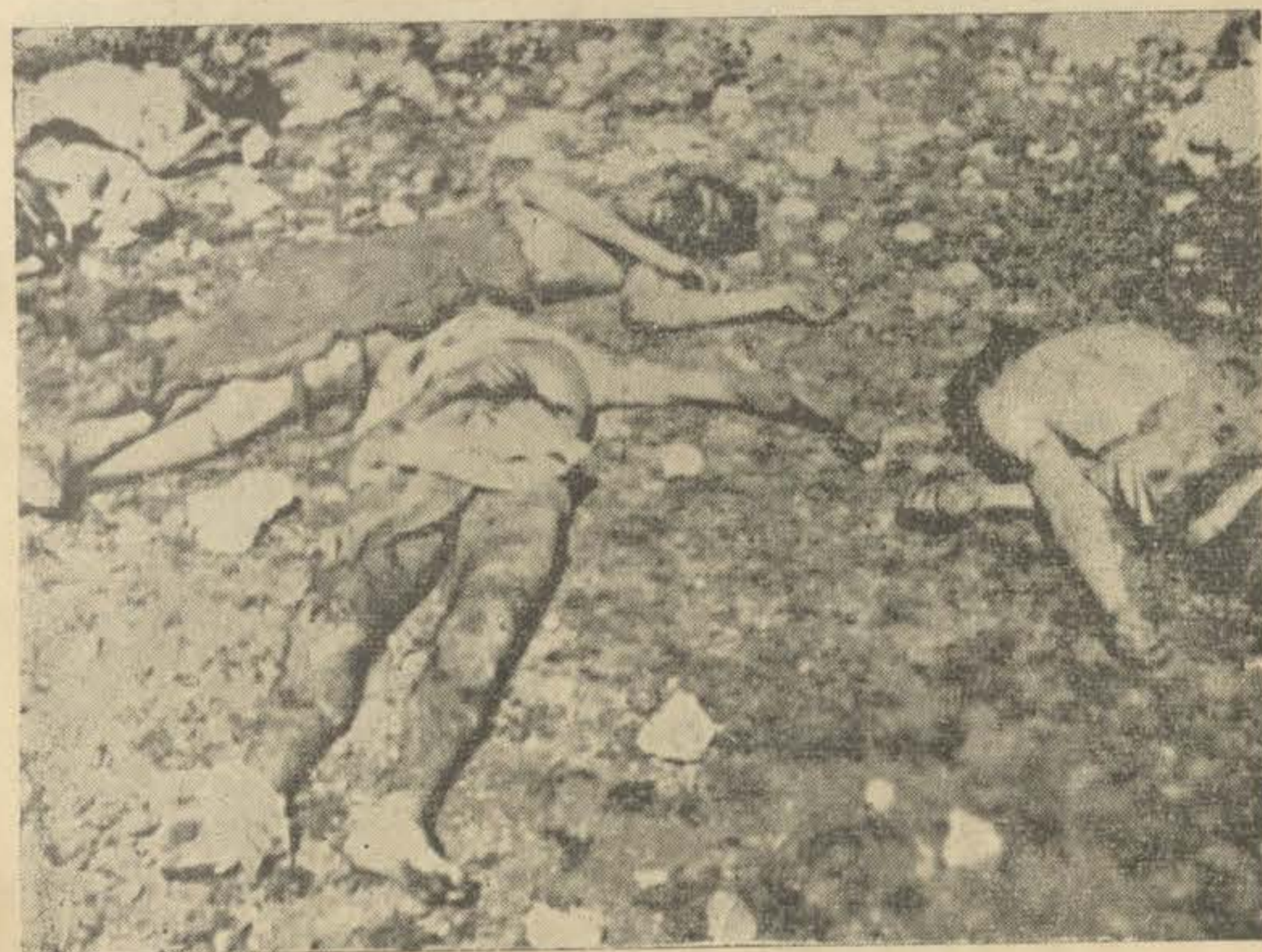
ZIONIST TERROR. Mangled bodies of Arabs murdered in the Beit El-Khoury massacre.