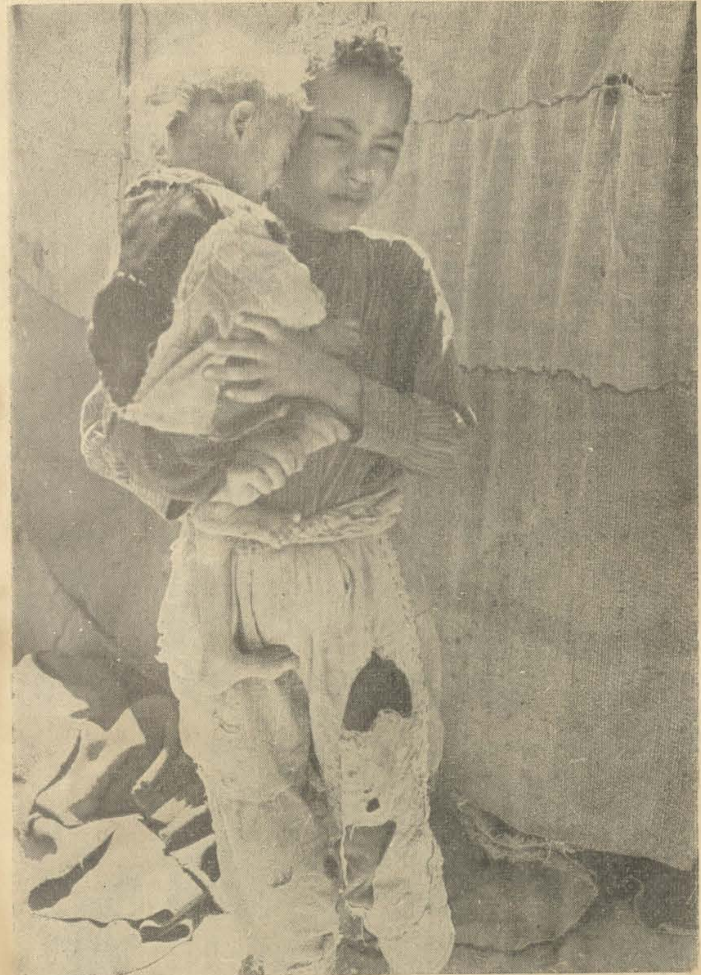
DESTITUTION. Father's whereabouts unknown, mother mercilessly murdered, 12-year-old Arab boy, in tatters, is lulling to sleep his baby sister.

On April 10, 1948, the village of Deir Yasin, in the suburbs of Jerusalem, was attacked by the Zionists, who rounded up most of its 600 inhabitants. Having looted everything of value in the village, the Zionists next turned their attention to their human booty, slaughtering men, women and children without mercy. On this occasion, about 250 Arabs were butchered. Among these were 25 pregnant women, whose bodies were deliberately ripped open with bayonets, and fifty-two mothers with babies at the breast, as well as about sixty other women and young girls. Little children were cut to pieces under the eyes of their mothers. Some of the unfortunate Arab women and girls were captured, stripped of all their clothing, and herded into open trucks. They were then paraded through the streets of the Jewish Quarter of Jerusalem, where they were subjected to the insults of the populace, and were forced to submit to being photographed stark naked.