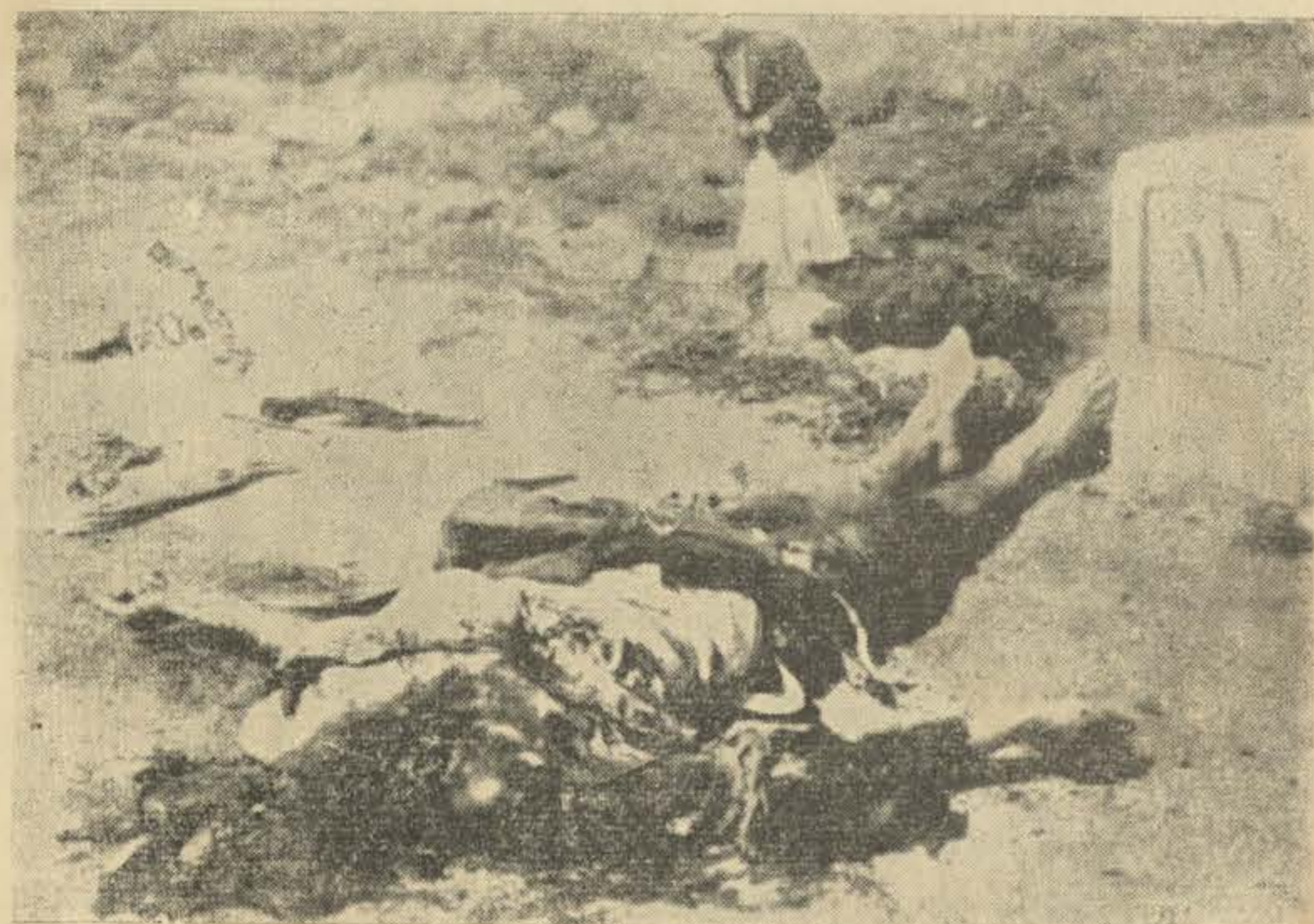
ON THE ROAD TO BETHLEHEM. Murdered Arab mutilated beyond recognition.

On May 13, 1948, the Zionists attacked a village named Beit Darras, in the Gaza district. However, they found the inhabitants to consist of children, women and some elderly persons. These innocent and harmless people were promptly and brutally murdered in cold blood. Some of the women were pregnant and were subjected to the same ghastly treatment as was given to the pregnant