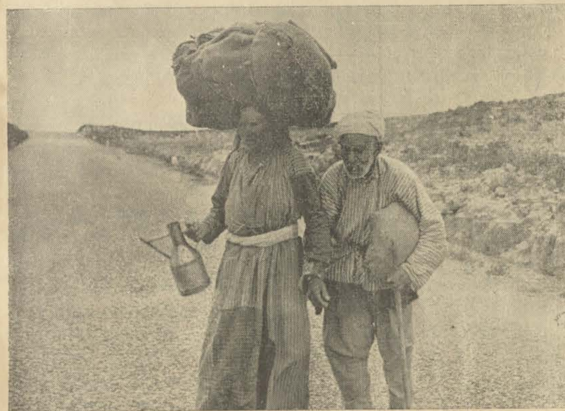
DESTITUTION. Homeless and weighed down with worry and oppression, these aged Arab couple are wandering wearily in search of shelter.

After the capture of Safed by the Zionists, all the able-bodied civilians were found to have escaped, and all those left behind were