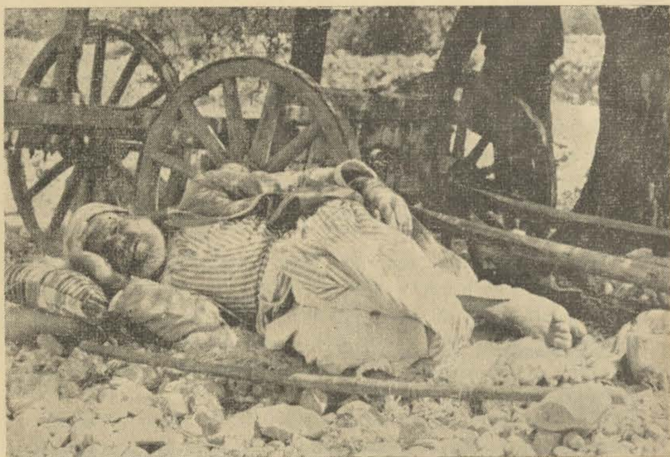
HIS LABOUR DONE. Consumed with fatigue and hunger, this venerable Arab octogenarian collapsed, not to rise again, on a heap of stones by the roadside.

Arab civilians were also evicted from their homes and herded together in unhygienic quarters, where sanitary conditions were non-existent. They were furthermore issued with such a meagre ration of food and water, that they were hardly able to exist upon it. This was a deliberate act of wanton cruelty, and not due to a lack of food and water. In fact, all the treatment meted out by the Zionists to civilians and prisoners was deliberately aimed at causing them suffering and humiliation.