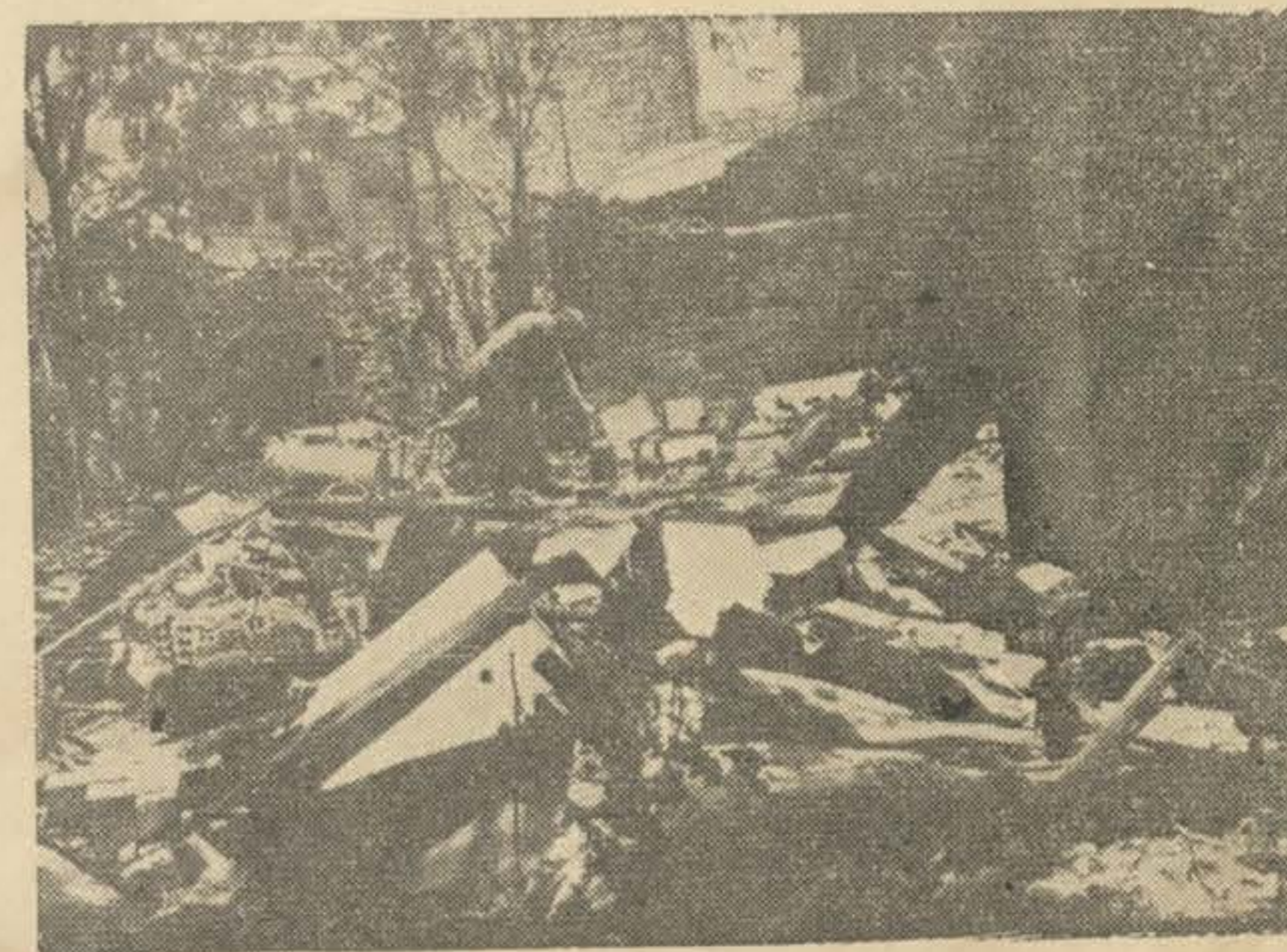
ZIONIST SACRILEGE. Monastery reduced to ruins.

In Jerusalem, the Zionists occupied various Christian Holy places, using them as military bases, forts and arsenals. When forced to retreat, they want only damaged and in some cases burned down these sacred buildings. The French and Italian hospitals were occupied by the Zionists despite the fact that both were flying the Red Cross flag.