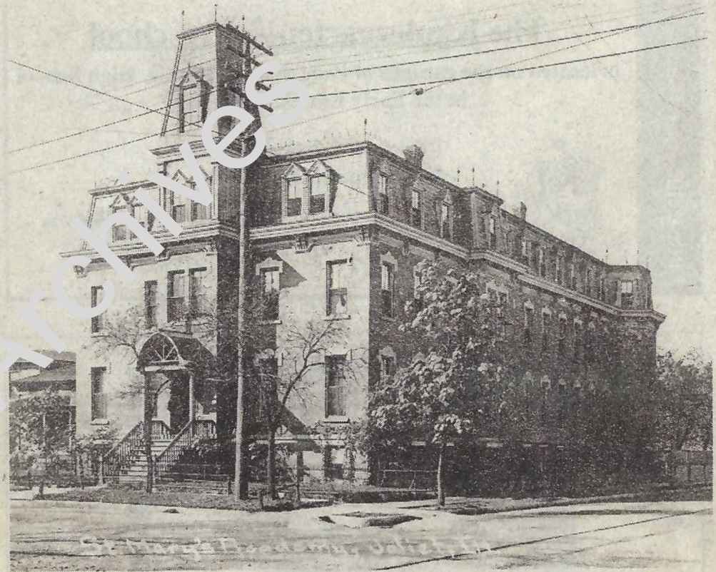
ORIGINAL SCHOOL —In its 76-year history, today's Providence Catholic High School has met the challenge of change, including name change and relocation. Providence got its start as St. Mary's Academy, shown in this 1915 photo, which was located at Cass and Ottawa streets in downtown Joliet.