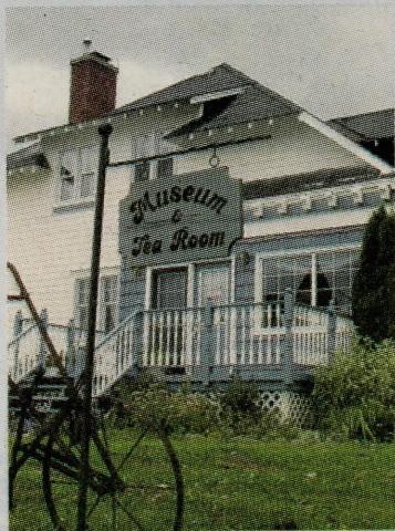
CAPREOL'S RAIL MUSEUM