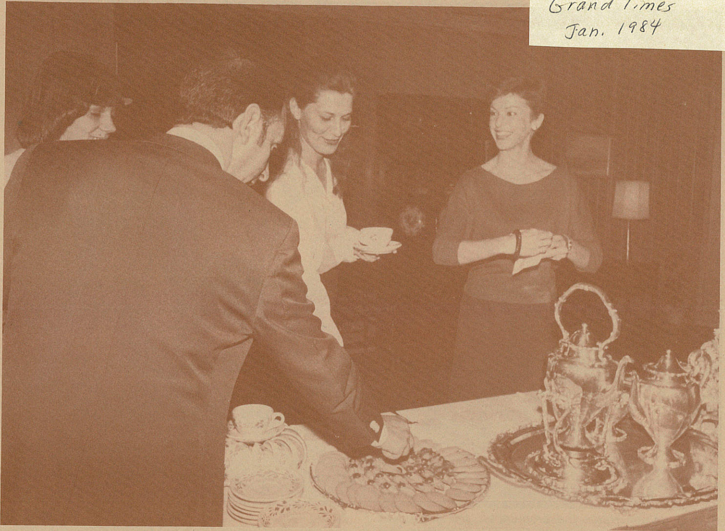
Grand Hotel guests are enjoying the new High Tea offered daily from 4 p.m. to 5 p.m. in the lobby. Tea,

coffee, and fresh baked cookies and pastries straight from the Grand Hotel ovens are complimentary.