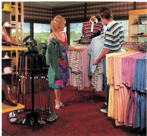
Our pro shop carries everything for outdoor fun.

For a small meeting or special celebration, you may want to consider one of the many elegant suites— hospitality or V.I.P. deluxe .