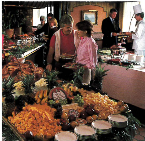
Our opulent brunch makes Sunday an event!

Feel like dancing? Our live orchestra will sweep you off your feet nightly—for dinner and after-dinner dancing.