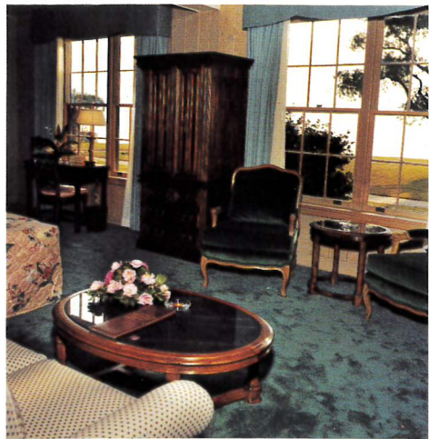
Charming guest rooms with marvelous views.

All 310 oversized rooms are either new or have been completely renovated, enlarged, and redecorated (with careful consideration given to historic preservation and detail). So now all rooms at the Grand are truly commodious, with renovated rooms in the main building offering twice as much space as before!