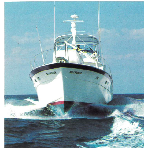
Board our Bullfisher for thrilling deep-sea fishing.

Tennis enthusiasts will be thrilled to discover 10 tempting Rubico-surfaced courts, located near the main lobby. Guests can even sign up for lessons, taught by one of our professional tennis instructors. And any of our staff pros will gladly arrange to put together a golf or tennis tournament for meeting goers...and meeting planners!