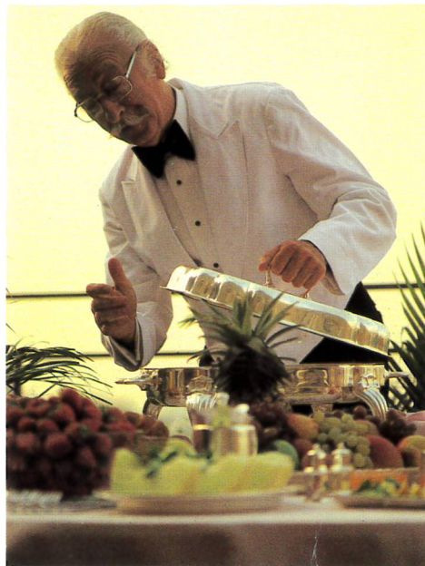
Delectable food presentations await guests.

Dining at the Grand is pure ambrosia served in a charming atmosphere. Start the day with a complimentary coffee in the lobby (for early risers), or sit down to a superb buffet breakfast in the Gazebo Room . Enjoy a delicious lunch in our dining room...at Lakewood Golf Club's restaurant...or under the sun at our poolside grill and snack bar.