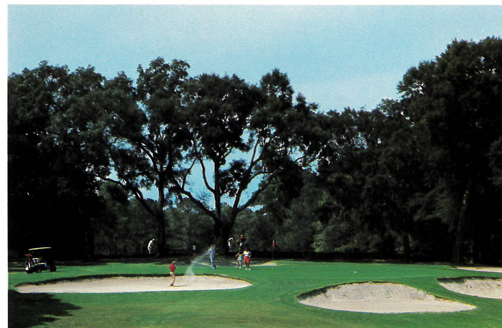
Enjoy a relaxing round of golf on Lakewood Golf Club's internationally-known course.

Our marina has lots of room for docking—