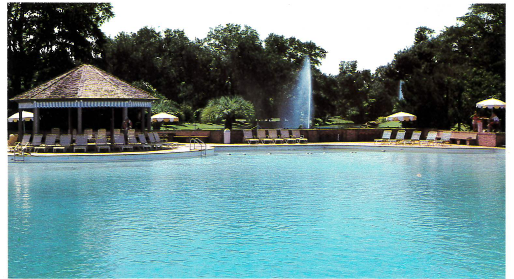
Take the plunge in our huge, 750,000-gallon swimming pool.

40 slips in all. And for guests who don't own boats, we offer sailboats, powerboats with water skis, paddleboats, and skiffs.