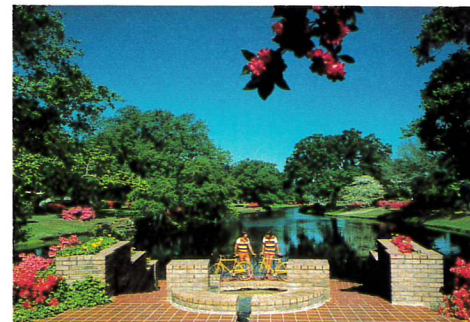
Acres of colorful beauty abound.

It's a long, enjoyable course with new traps, well-marked cart paths, and easy-to-follow tee signs. Meeting goers can play a full round...or a few holes between meetings.