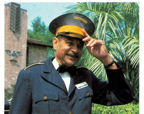
Our service makes guests feel right at home.

For youngsters from ages 5 to 12, we have a Junior Hostess Program throughout the summer and on all major holidays. Our qualified staff members will plan an exciting array of activities guaranteed to delight youngsters and send them home with many happy memories.