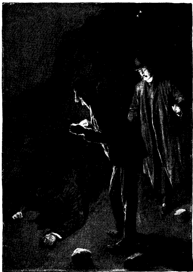
It was a prostrate man, face downwards.