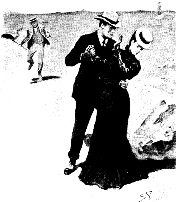
Sir Henry suddenly drew Miss Stapleton to his side.