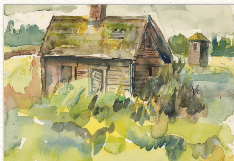
Engle's Sheepherder's House

“During the summer of 1978 I painted these scenes of surrounding farms and historic structures. They remained stored and forgotten for over 30 years. All that is left of some of the barns and buildings is what our fading memories hold. I want to share with you these images to remind you of just how lucky we are to have the historic reserve.”