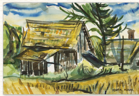
Ferry House Barn (Ebey Inn)