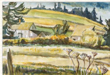
Ferry House (Ebey's Inn)