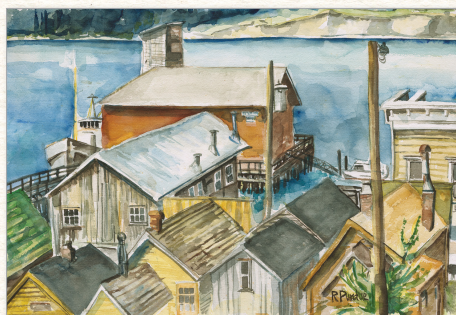
Coupeville Wharf and Front Street Roofline