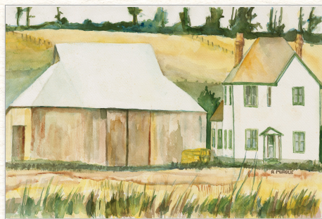
Smith House and Barn