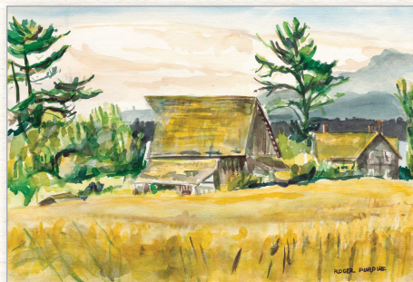
Ferry House Barn and House (Ebey's Inn)