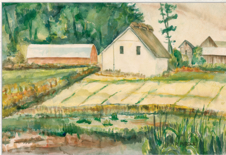
Wilbur Sherman Grainery