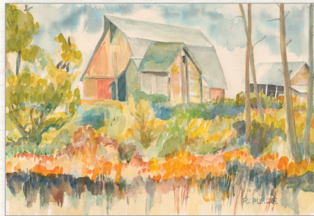
Boyer Barn (Comstock Barn)