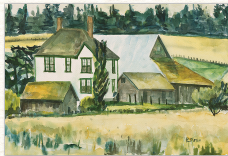
Smith Farm (Willow Wood Farm)