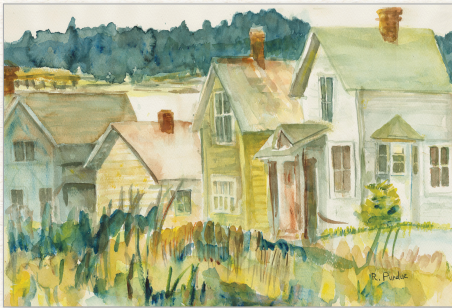
Back Door to Front Street Shop

"During the summer of 1978 I painted these scenes of surrounding farms and historic structures. They remained stored and forgotten for over 30 years. All that is left of some of the barns and buildings is what our fading memories hold. I want to share with you these images to remind you of just how lucky we are to have the historic reserve."