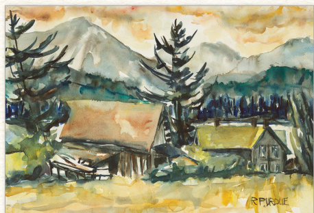
Ferry House Storm